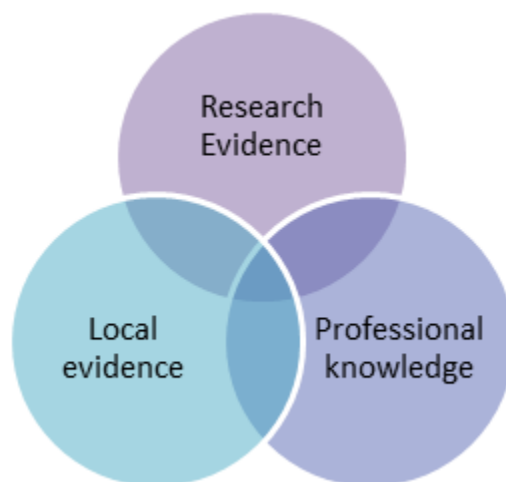
Figure 2.1. Bringing the evidence sources together (Koufogiannakis, 2011, p. 53)

The revised model looks at the whole of evidence based practice, incorporating research evidence as well as local evidence and professional knowledge (Figure 2.1). Good research evidence provides us with findings from quantitative and qualitative research that is undertaken according to methods which allow us to have confidence in the outcome of the research. Hence, we can have greater trust in the research than we would in someone's anecdotal account, for example. Of course, not all published research is necessarily of such a high standard, which is why we must be careful when using research results, and this will be explored further in Chapter 5, Assess . But in general, research is an essential part of evidence based practice because it brings us closer to building a body of knowledge that is based upon sound methods, well documented process, and rigorous interpretation of the data.