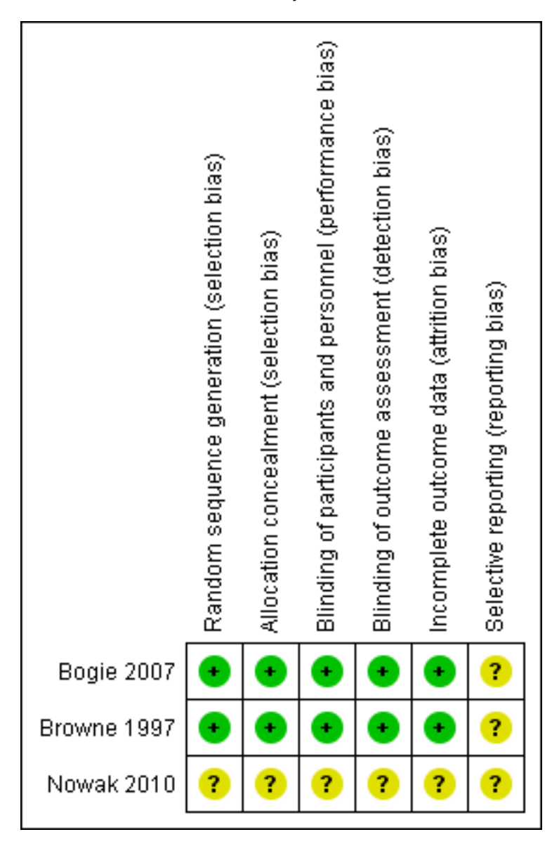
Figure 3. 'Risk of bias' summary: review authors' judgements about each risk of bias item for each included study.