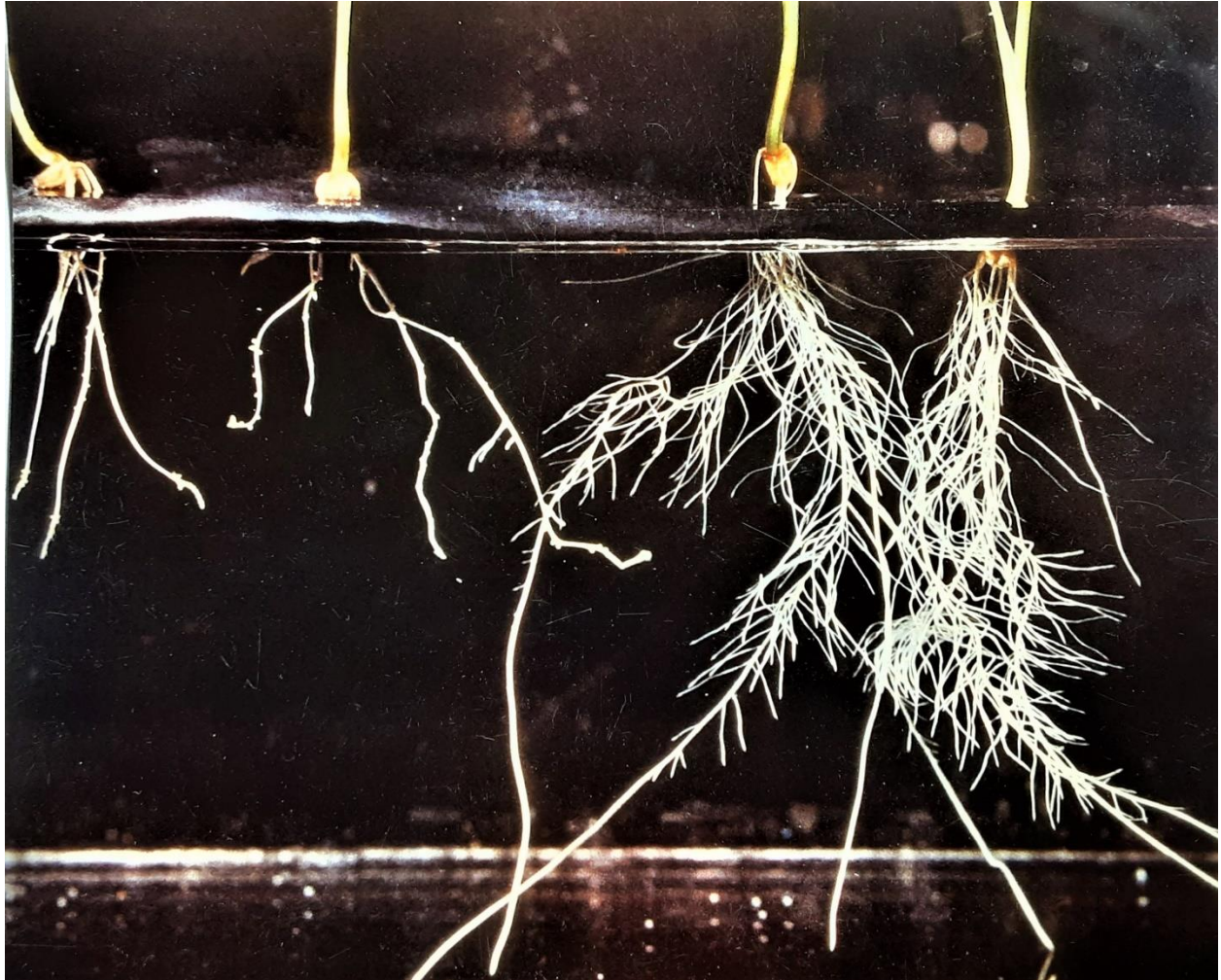
Left: Katepwa, acidic soil intolerant