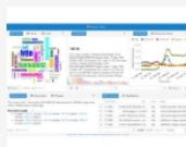
Voyant Tools 2.0 (Corpus View)