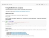
Complex Sentiment Analysis