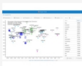
Voyant 2.0: ScatterPlot