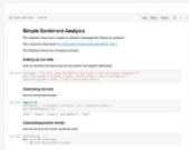
Simple Sentiment Analysis