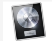
Logic Pro X