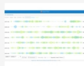
Voyant 2.0: Bubblelines