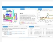
Voyant Tools 2.0 (Corpus View)