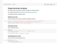
Simple Sentiment Analysis