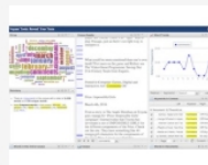
Voyant (Default Skin)