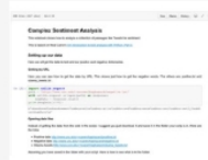
Complex Sentiment Analysis