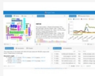
Voyant Tools 2.0 (Corpus View)