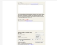
Google Blogsearch Scraper