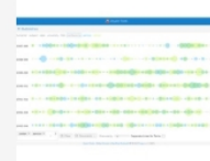
Voyant 2.0: Bubblelines