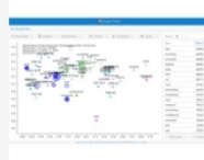
Voyant 2.0: ScatterPlot