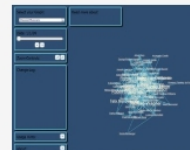
Wiki Map Project