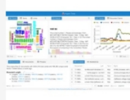
Voyant Tools 2.0 (Corpus View)