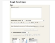
Google News Scraper