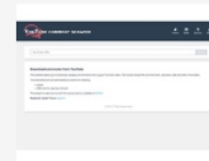
YouTube Comment Scraper