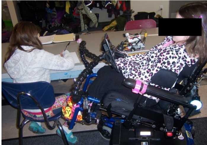
Fig 1. The Atypical participant is controlling the Lego robot from her iPad Mini. She has just moved the robot and ruler beside a pencil to line up the ends and read the length of the pencil from the ruler. The Typical peer is recording the answer in the workbook.

Lego Mindstorms Commander program installed on it. Several items around the classroom were used as objects to measure. See Figure 1 for the set-up.