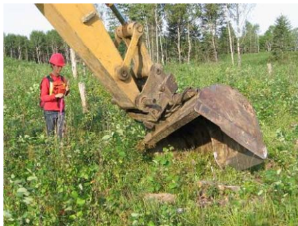
Root excavations to determine density and depth of aspen roots.

Methods: In Western Manitoba (near Roblin) 10 study sites were located in aspen stands with a hazel understory prior to logging. In each site an area with hazel (47,000 hazel stem/ha) was paired with an adjacent area relatively free of hazel (3,600 hazel stem/ha). Sites were logged and left to grow for one growing season. At the end of the growing season