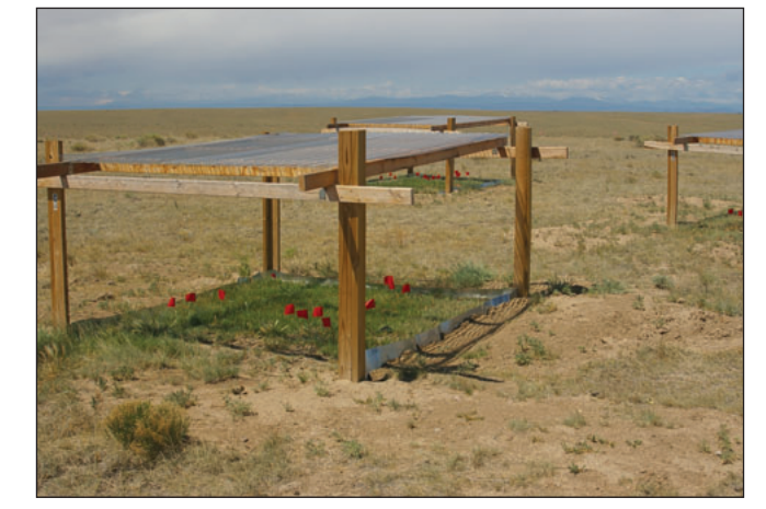
Figure 4. Example of the style of rain-out shelter proposed for the CDE to test the effects of drought in grasslands (corresponding map location in Figure 3: US [12]).

Advantages of the CDE approach over the meta-analysis approach are evident when examining the consequences of rainfall manipulations. Unlike ecological CDEs, meta-analyses are not designed to test for withinsite differences or the complexity of interaction effects. For example, if plant biomass within half of the rain-out shelters in one site responded negatively and the other half in the same site responded positively, a meta-analysis might interpret the site response as having no overall effect. Because data from an ecological CDE are standardized, it is possible to test for interactive site differences, both within a site and among sites, as well as accounting for covarying climate and habitat variables, assuming these properties are also monitored as a part of the CDE.