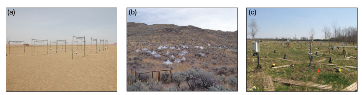
Figure 2. Examples of different warming manipulation methods conducted on grasslands with corresponding map locations in Figure 3: (a) China (32) and (b and c) Canada (4 and 22).

logical CDEs are not unknown (eg Hector et al. 1999; Pywell et al. 2002; Wright et al. 2004; Heisler-White et al. 2009; Royer et al. 2009). However, experiments that include multiple geographically distinct sites are often limited spatially by the logistical challenges and cost when a single group conducts the research. Recently, however, a handful of collaborative ecological research networks have been established that facilitate integration of data across large spatial scales. For example, FLUXNET (Baldocchi et al. 2001), a global network of 500 micrometeorological tower sites from 30 regional networks across five continents, has been effective at combining ecosystem CO<sub>2</sub> flux data. Likewise, the US National Ecological Observatory Network (NEON; Keller et al. 2008), although restricted to the confines of a single country, is being designed to specifically include sites from 20 eco-climate domains, and aims to facilitate the coordinated study of ecological responses to globalchange factors across a broad geographic range.