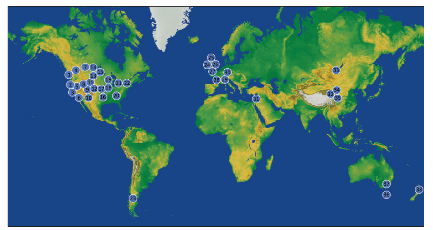
Figure 3. World map identifying the locations of climate-change experiments in grasslands, numbered from west to east: 1 – Vancouver Island, Canada; 2 and 3 – California; 4 – British Columbia, Canada; 5 – Nevada; 6 – California; 7 – Alberta, Canada; 8 – Utah; 9 – Colorado; 10 – New Mexico; 11 – Wyoming; 12 – Colorado; 13 and 14 – Saskatchewan, Canada; 15 – Manitoba, Canada; 16 – Oklahoma; 17 and 18 – Kansas; 19 – Minnesota; 20 – Tennessee; 21 and 22 – Ontario, Canada; 23 – Chubut, Argentina; 24 – Wales, UK; 25 – Cumbria, UK; 26 – Derbyshire, UK; 27 – Oxfordshire, UK; 28 – Languedoc-Roussillon, France; 29 – Switzerland; 30 – Bayreuth, Germany; 31 – Israel; 32 – Tibetan Plateau, China; 33 – Northern Mongolia; 34 and 35 – Tibetan Plateau, China; 36 – Tasmania, Australia; 37 – Bogong High Plains, Australia; 38 – New Zealand. Labels for some experiments have been moved slightly from their true location for legibility.

invested researchers, and while this can be done "remotely" via e-mail, listservs, and social media, we recommend an organized workshop, which can be coordinated to run during an international conference to maximize attendance. We encourage organizing committees of international ecology conferences to accommodate CDE workshops. A welldesigned protocol can serve as a recruitment tool to enlarge the network, especially in identified geographical gaps, and as the basis for subsequent grant proposals. Once a CDE is underway, annual or biennial workshops can serve to strengthen the network and maximize productivity. Few funding agencies support large intercontinental ecological experiments, but we expect that the international demand for suitable funding mechanisms will increase as CDEs become more common. We strongly recommend that national and transnational research agencies and foundations establish and promote international agreements for the funding of participating researchers in CDEs.