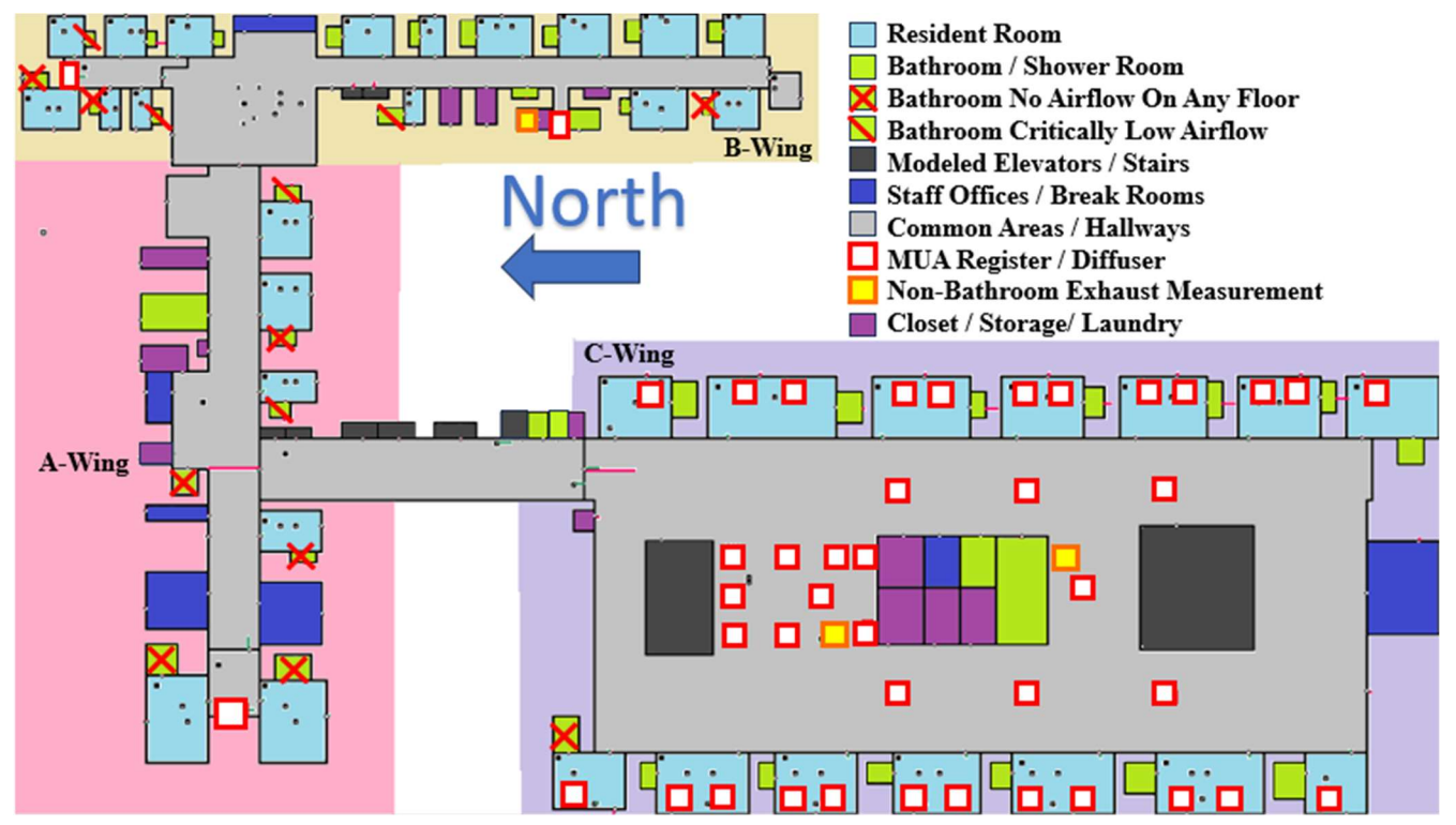
Figure 3: Typical Floor Layout for EGCCC Resident Floors 4, 5 and 7