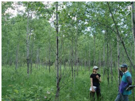
1500 residual stems – 5 years after thinning in the Lac La Biche region showing very little resprouting.

Methods: We studied 10-year old aspen stands of harvest origin with an initial sucker density of ~ 20,000 stems/Ha. Large 0.25 ha plots were thinned to 0, 500 or 1500 stems/Ha in both the Lac La Biche and the Peace River regions of Alberta. Thinning was done by brush sawing and each region had 5 replicate blocks. These plots were re-evaluated 5 years after thinning.