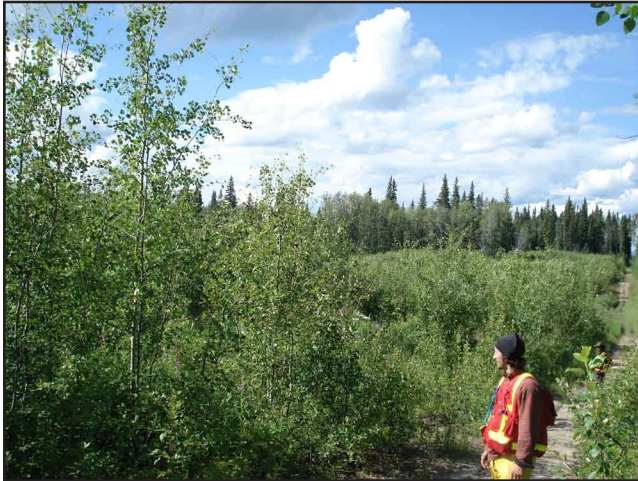
Figure 4. Clearcuts had the highest density and the largest suckers 9 years after logging (>20,000 stems/ha).