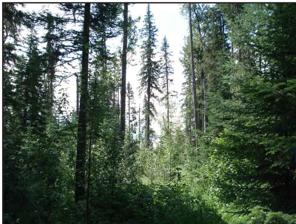
Figure 6. The coniferous stands with 50% residuals had a lower density of suckers, both because of the more intense shading of the spruce and because of the reduced density of aspen roots in the stand prior to logging. Growth of aspen stems was also suppressed relative to clearcuts.

Overall, the partial harvesting was more beneficial to the regeneration of the planted spruce compared to the natural regeneration of the shade-intolerant aspen. In the future, we will need to assess the natural regeneration of the spruce on these sites and secondly, assess the regeneration of aspen in variable-retention cuts which have undergone site preparation.