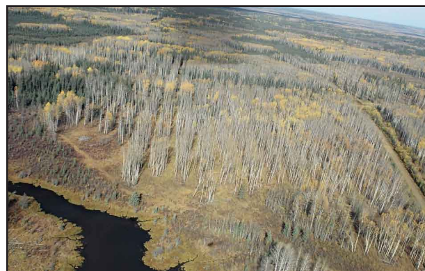
Figure 1. Overhead view of the EMEND Project.

The Ecosystem Management Emulating Natural Disturbance (EMEND) Project is a multi-partner, collaborative forest research program. The EMEND project documents the response of ecological processes to experimentally-delivered variable retention and fire treatments. The research site is located in the western boreal forest near Peace River, Alberta, Canada, with monitoring scheduled for an entire forest rotation (i.e. 80 years). Individual research projects evaluate which forest harvest and regenerative practices best maintain biotic communities, spatial patterns of forest structure, and functional ecosystem integrity, compared to mixedwood landscapes created by natural disturbances. Furthermore, economic and social analyses evaluate the long-term viability and acceptability of these practices. This research note, part of a series about the EMEND Project, summarizes results from several studies about forest regeneration.