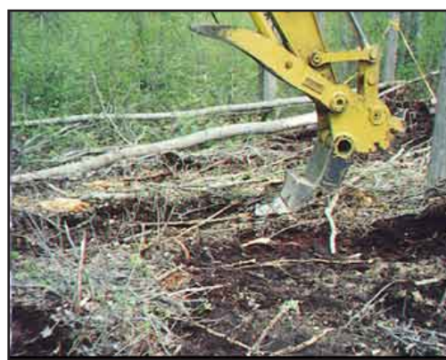
Figure 2. Burning of subplots and use of excavator to scalp areas of the site.