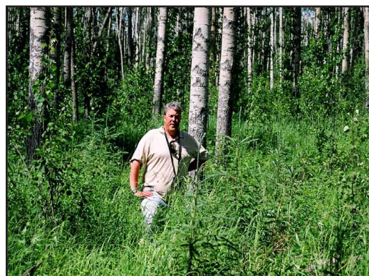
Figure 3. The worst and the best ways to promote spruce. Left: Spruce seedlings with 75% retention in the conifer sites and no site preparation treatment were 30 cm tall at year 7. Right: Spruce in 50% retention in the deciduous site with mixing site preparation were greater than 130 cm tall.