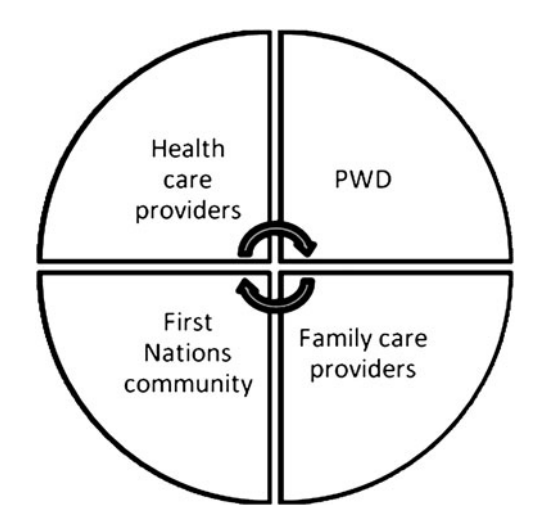
Figure 1: Knowledge stakeholders in First Nations dementia

A continuum of knowledge, from "knowing" (having knowledge) to "not knowing" (lacking knowledge) was identified. With respect to the sum of their knowledge, study participants occupied various points between these two states, while with respect to discrete pieces of knowledge, participants tended to occupy one of these two states. Two processes mediating the link between these two states were identified: sharing, and failing to share, knowledge. The numerous instances of knowledge sharing that occurred among the four