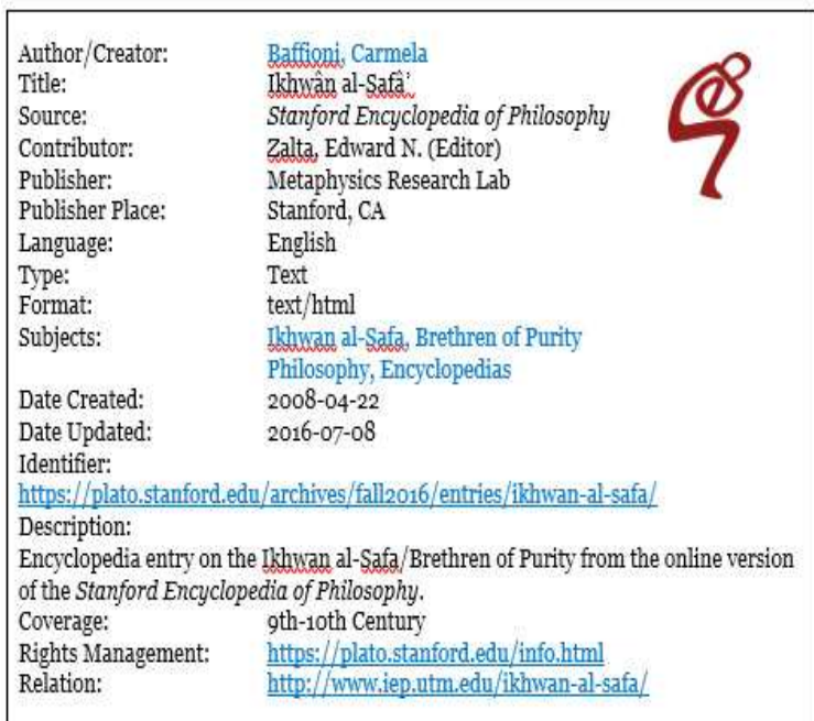
Figure 4 40

As mentioned earlier, the Addenda supplies a representative list of general and subject-specific resources consulted during its compilation. Part of the answer to that question is that Discovery Services, though quite thorough, do not index (or rather pre-index) all of these resources. Many of the resources searched inevitably retrieved duplicates, but also unique and undiscovered bibliographic data. Google Scholar, which has been used as a substitute for Discovery Services, 41 must also be used in conjunction with other resources in order to maximize comprehensiveness and completeness.