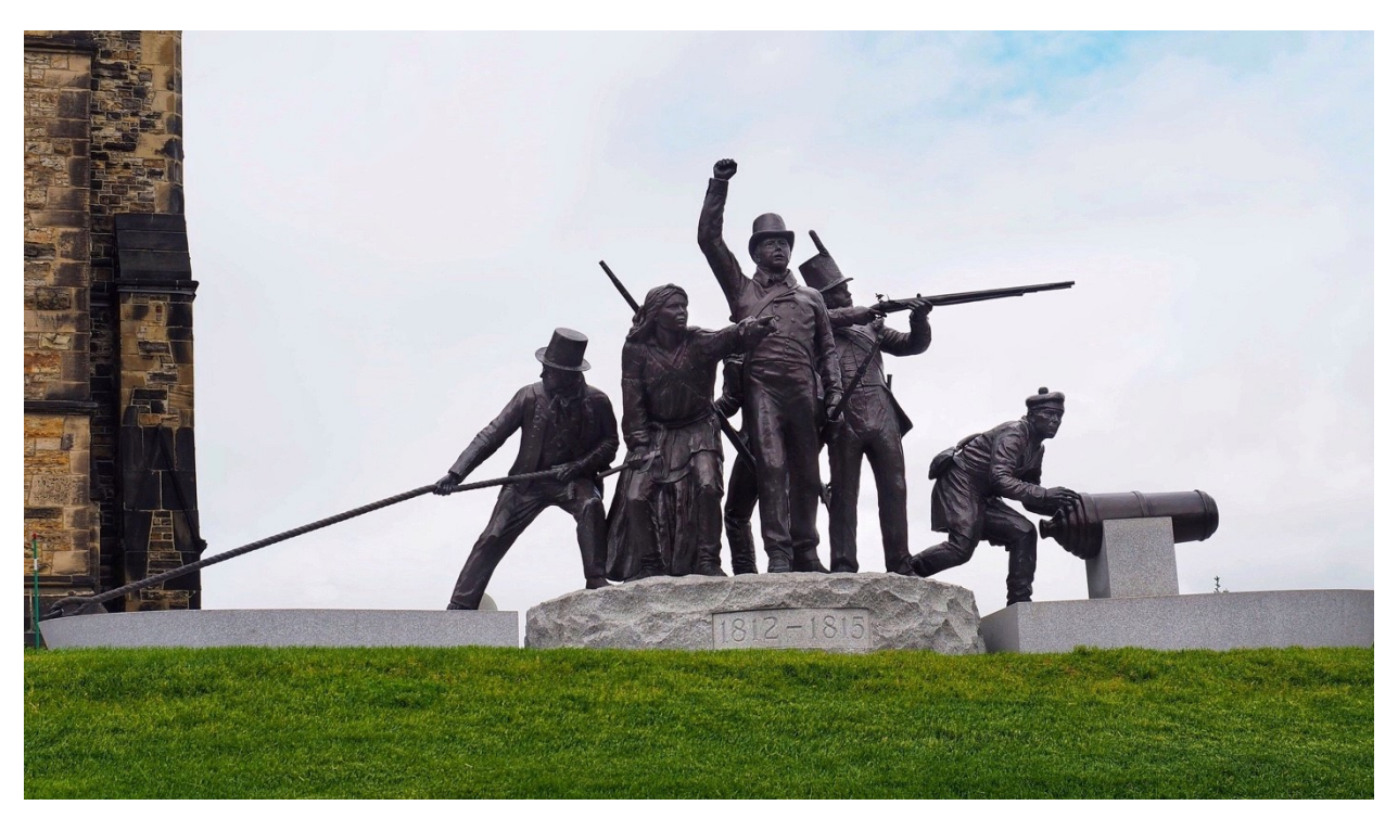
Figure 2: Photo, Triumph Through Diversity