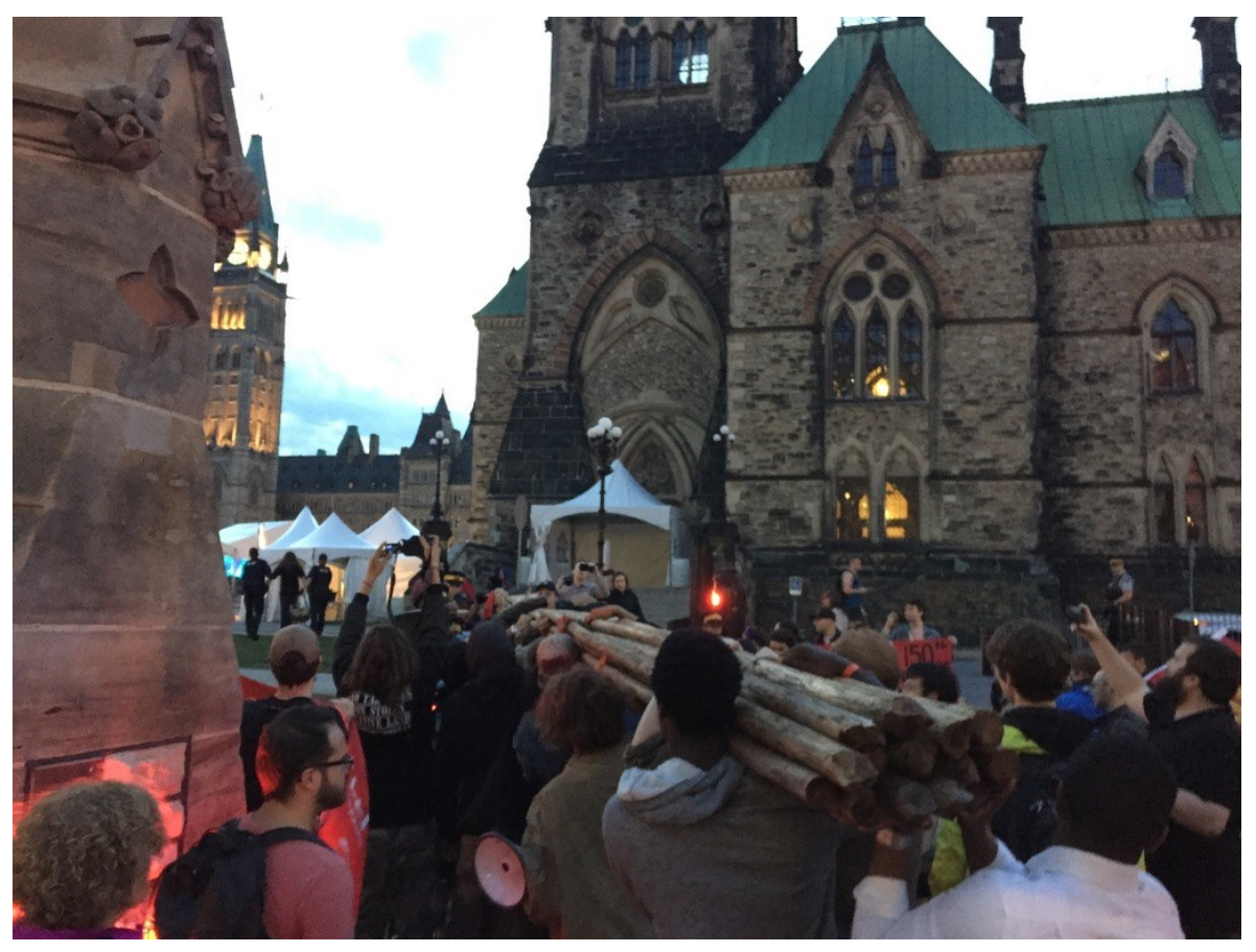
Figure 3 Photo: Water protectors carry tipi poles through Elgin Street entrance to Parliament Hill.

their way to a crime scene. In fact, Indigenous ceremony was criminalized that evening. As Brendon Nahwegezhic of Batchewana First Nation said in a press conference the following day, 29 June, "We marched with those poles up the road from the Human Rights Monument, and yet we had to fight for our right to practice our own traditions" (APTN News 2017).