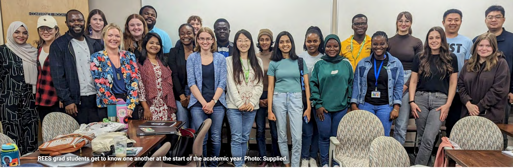
REES grad students get to know one another at the start of the academic year.