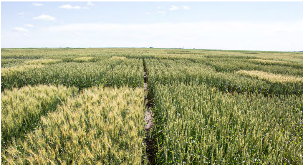
In this wheat trial, the different varieties grow in plots in close proximity to one another.