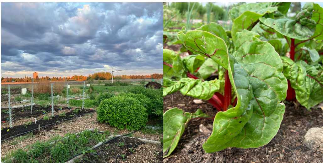
The Prairie Urban Farm (PUF) grows fruit and vegetables to support food vulnerable communities in Edmonton.

PUF is also a site for social scientific and community-based research and learning. There is much more social work going on in gardens than can be measured in weight of produce. Gardens are sites of recreation and exercise, places for finding belonging and building community, and for collectively navigating environmental uncertainties and what it means to live (and eat) sustainably. These layered social processes make gardens exciting spaces for conducting sustainability research with communities, and with direct benefits for participating citizens.