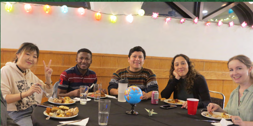
REESSA, the Resource Economics & Environmental Sociology Students' Association, goes to great efforts to support students in the department. Pictured is their popular annual event, a Heritage Night that welcomes students to share their culture and get to know one another during a potluck dinner.