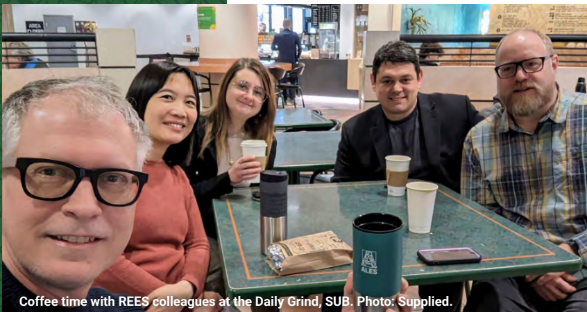
Coffee time with REES colleagues at the Daily Grind, SUB.