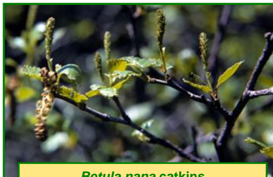
Betula nana catkins

Seed: Samaras with wings narrower than body, broadest near summit, extended slightly beyond body apically (eFloras n.d.).