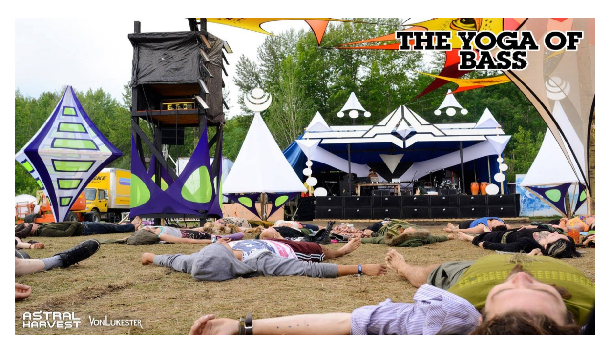
3. The Yoga of Bass workshop at Interstellevator main stage, Astral Harvest (2013)

the earth, and from Spirit. We want for all of us to leave having experienced at least a brief moment of real connection" (Perry, 2013, p. 4). Similarly, Sean Hoess, co-founder of Wanderlust festival (multiple locations worldwide), asserts: "Transcendence is not something that can be reduced to a formula or series of steps. It happens in the places between, by the random interactions of the many wonderful people who attend, so the best you can hope is that you create the right conditions" (Perry, 2013, p. 2). Rasenick and Hoess gesture to how transformational festivals try to open space for people to connect with each other, the earth, and a sense of something larger than themselves. Although their comments are somewhat vague, perhaps it is because concepts like connection, transcendence, and transformation are nebulous and multidimensional. Regardless, organizers gesture to centrally meaningful elements of transformational festival timespaces that the present work seeks to investigate and elaborate upon.