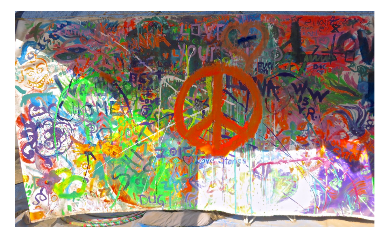
11. Co-created canvas at the end of Shambhala (2015)