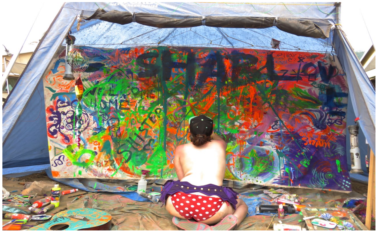
10. Co-created canvas midway through Shambhala (2015)