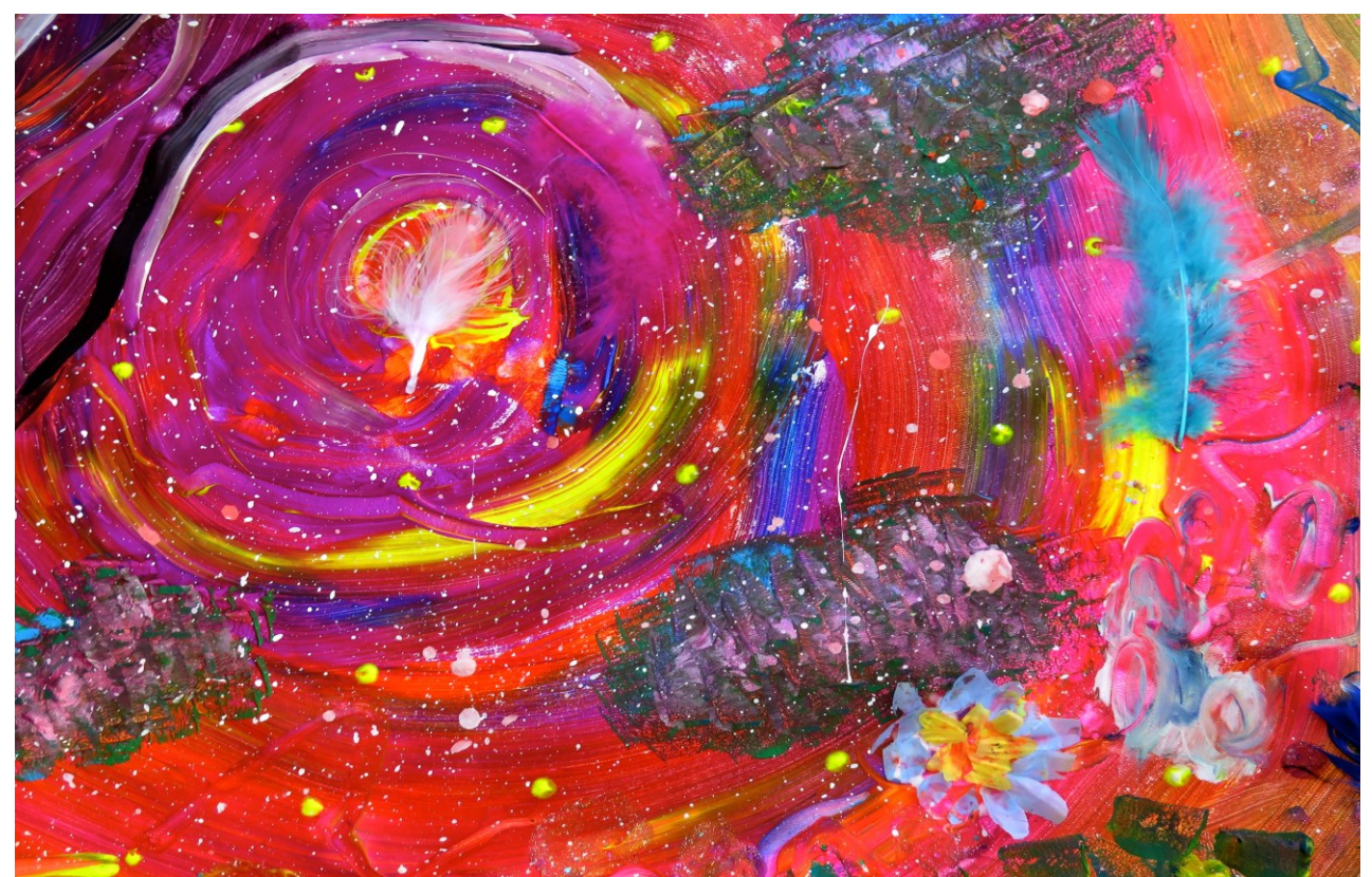
18. Collaborative art piece at Astral Harvest festival (2015)

Her words strike me – her tone implies this is brave gesture for a sober person. I am amused and happy I have achieved this level of uninhibited freedom without the assistance of a consciousness-modifying substance. Tonight, my container was stretched into new dimensions of possibility, purely from celebrating with great music and supportive community. What was initially going to be a relaxed evening spontaneously evolved into a revealing expansion of self-confidence. I continue to be surprised by the lessons I receive and the transformations of self-concept that can emerge from unexpected places.