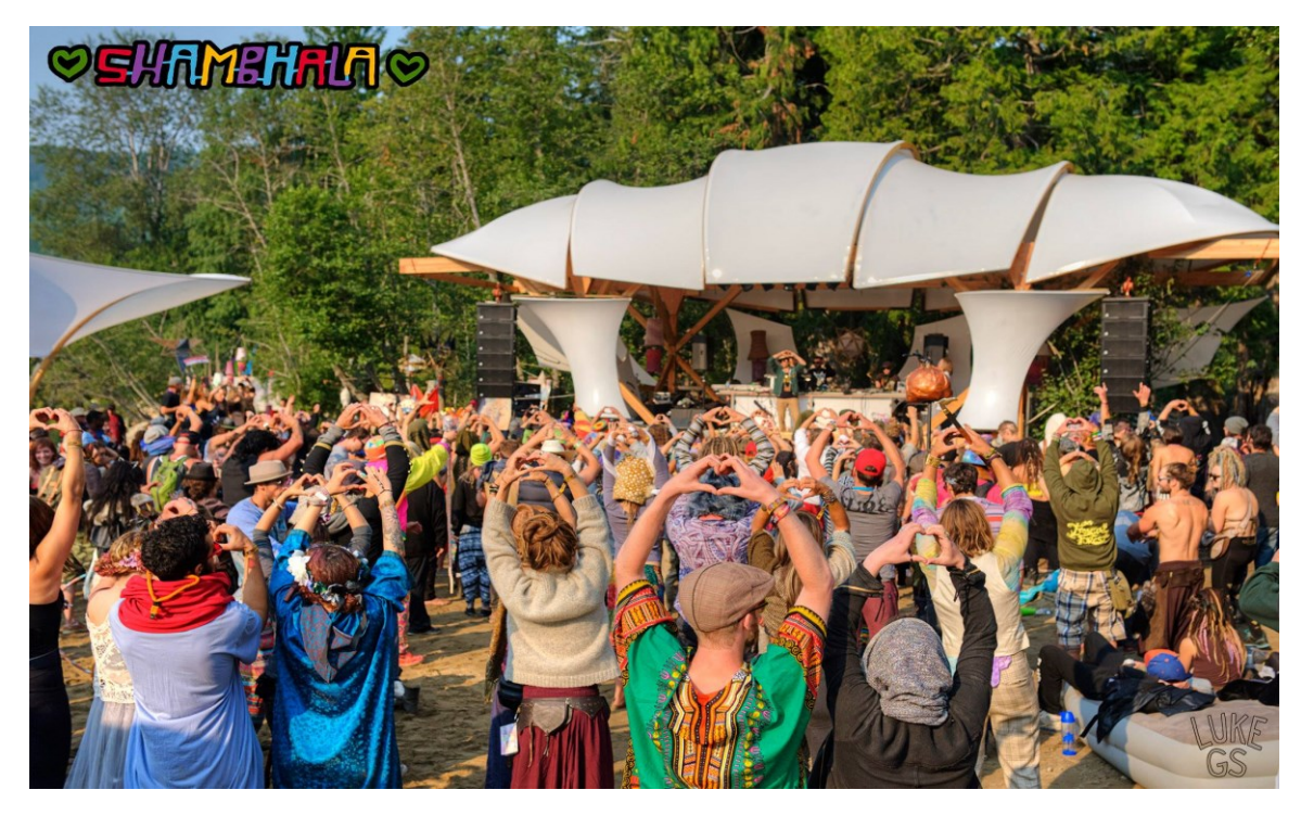
1. The Living Room stage during DJ Pumpkin's set, Shambhala Music Festival (2014)