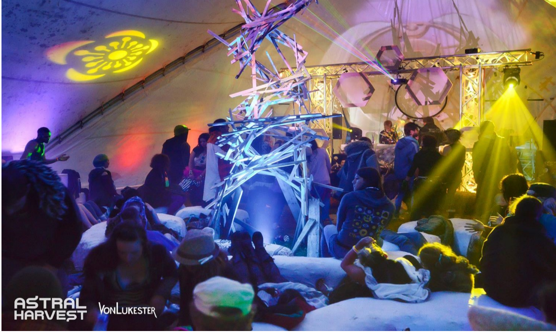
15. Angelica's Basket stage, Astral Harvest festival (2013)

practice, it is nonetheless a relational strategy that is employed to connect festivalgoers with one another, with spirituality, and the larger cosmos (see Schmidt, 2015).