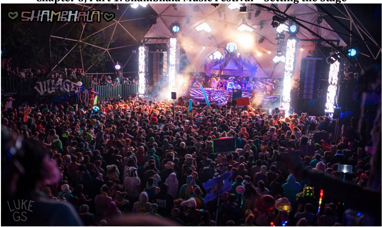
Chapter 5, Part 1: Shambhala Music Festival - Setting the Stage

4. Village stage, Shambhala Music Festival (2014)