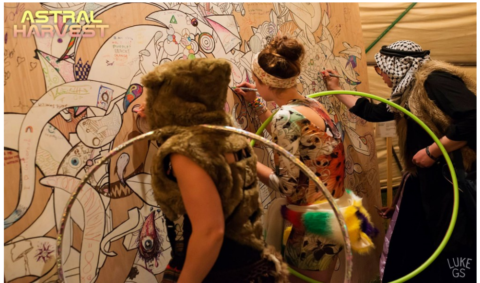
16. Participants adding to collaborative artwork in the Synestellar Artrium, Astral Harvest festival (2014)

Ceremony is present at Astral Harvest in the form of community-sourced offerings. The festival supports an opening and closing ceremony led by different people every year. In 2014, the opening was a participatory music-making ceremony entitled "Rhythm and Connection" (Astral program, 2014, p. 38), while the closing was a "Medicine of Community" intentional sharing circle (p. 36). Conferences also bring ceremony into the festival: Examples include "Sacred Fire Ceremony," "Shamanic Sound Medicine Journey," and "Journey to the Medicine Wheel" (Astral program, 2014, p. 37-38). As evidenced here, ceremonies at transformational festivals are often grounded in Western interpretations and appropriation of shamanic rituals and Indigenous cultural practices.