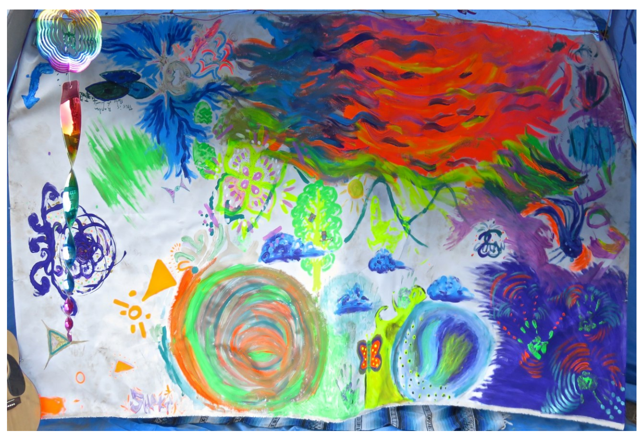
9. Initial co-created canvas at the beginning of Shambhala (2015)

narrative. Encounters were brief, exploratory, and happened by chance, but they were layered with potential meaning for participants. The art piece evolved significantly from the beginning of the festival to the end as more and more people inscribed themselves on the canvas. The following pages demonstrate the artwork's aesthetic evolution over time.