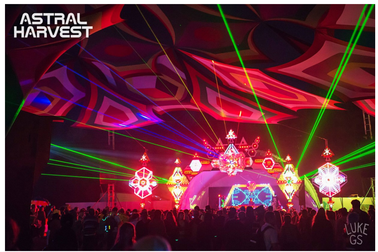
14. Interstellevator main stage, Astral Harvest festival (2014)

Despite its substantial size, Astral Harvest's promotional materials imply that the event has a friendly familiarity similar to being "at home." Their website begins with the opening line: "Home is not a place, it's a feeling" (Astral website, 2016). In previous years, their tagline read: "Home is where the Harvest is" (Kiddo, 2015). The combination of this rhetoric with the large amount of scheduled offerings indicates an intention to create a diverse, well-balanced, and community-integrated experience. This is accomplished through their focus on delivering exceptional music-dance experiences, diverse array of participatory activities such as workshops and ceremony, conscious intention to support families and children, and supporting infrastructure.