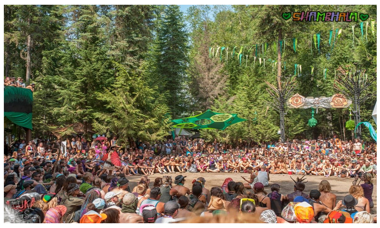
7. The Grove stage during opening ceremonies, Shambhala Music Festival (2014)

landscape helps to initiate festival goers into a celebratory journey and to connect them with others in ways that may not be commonly encountered in everyday life.