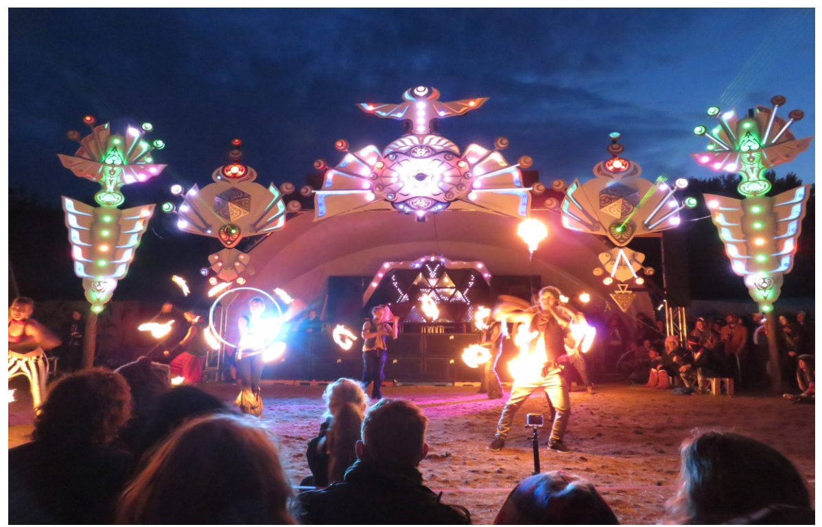
19. TransFlowmation fire show at Interstellevator, Astral Harvest festival (2015)

creation. A spectrum of big kids and small kids freely slapped paint on canvas, talking quietly as they played together, letting their bodies dance across the painting; self-expression without judgment. A friend strummed his guitar and sang serenely, set against the soundtrack of the pounding storm above. His music serenaded a silky sliding of shades, wet with fat droplets of rain. A beautiful disaster emerged from the experience; messy splendour at once colorful and cohesive; primal and futuristic. The presence of humans belied by footprints, like fluorescent animal tracks. Space-like organisms playfully swirl into curving complexity and completeness. Boundaries are permeable, merging synchronistically with neighbouring artworks to create a sense of wholeness and oneness. The piece radiates a calm chaos, an emotional map of a day at this festival.