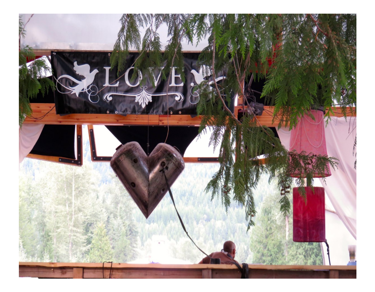
28. Living Room stage seen from the back, Shambhala Music Festival (2015)

of elements enhanced the attunement and attentiveness of participants to others as they synchronized with communal rhythms. Increased awareness of selves as plural and relational beings produced transformations in how people related to each other, and themselves, in everyday life.