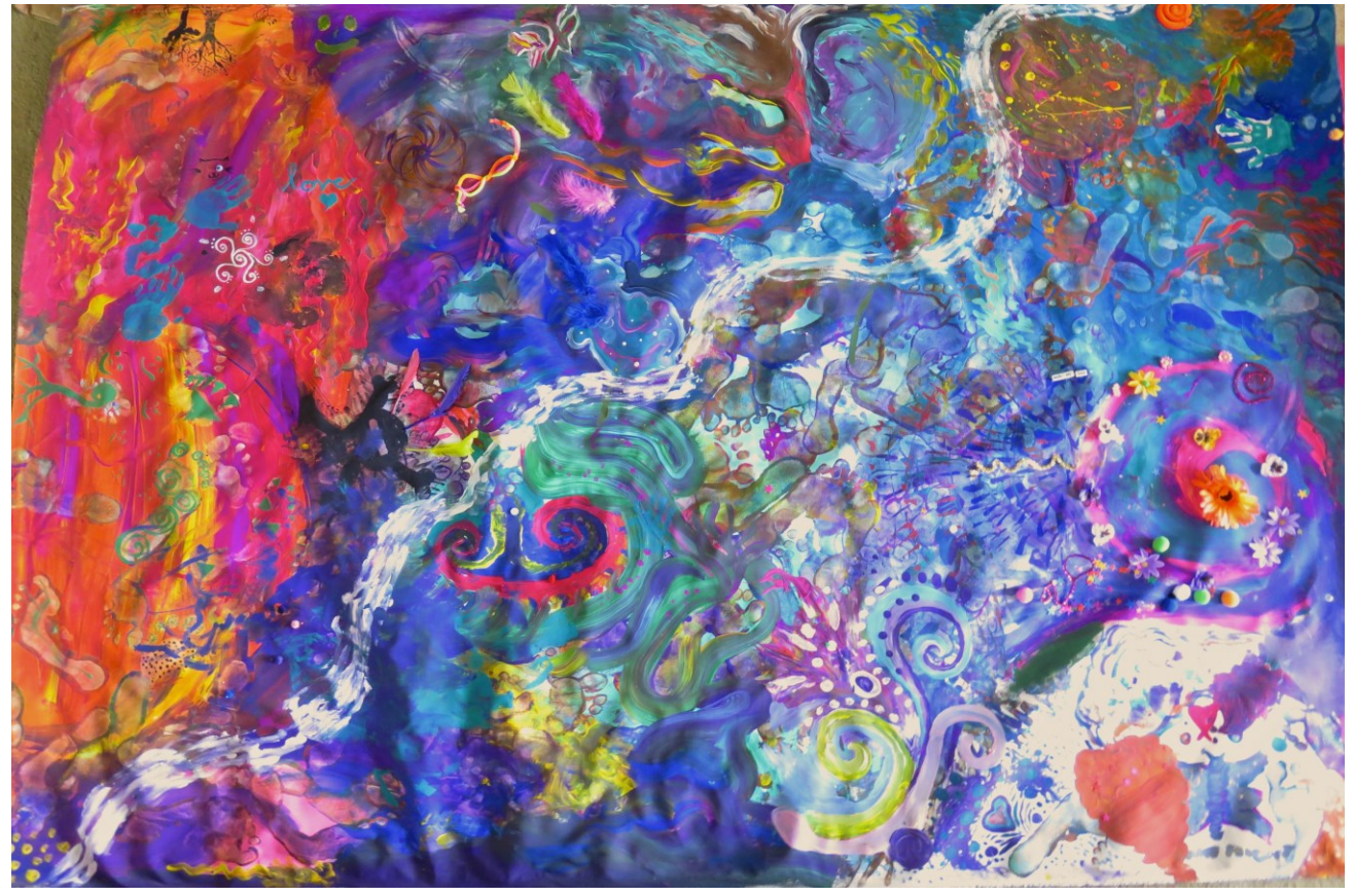
27. Collaborative art canvas created at Intention Alberta festival (2016)