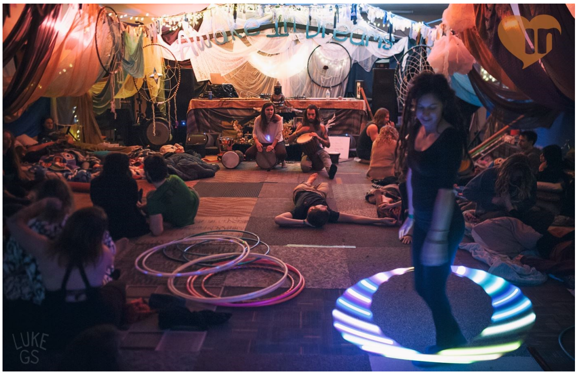
24. Dance hall and workshop space, Intention Alberta 9: Awake in Dreams (2016)

atmosphere. This is accomplished in a number of ways, notably through the inclusion of families and children, empowering community participation in workshops and art, enabling ecstatic music-dance experiences, organizing rituals and ceremonies, and providing supportive infrastructure.