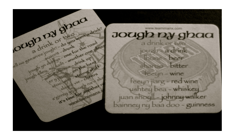
Figure 4: Manx Gaelic Coasters

common drinks, as well as basic ordering instructions ensuring learners who frequent pubs can order in Manx, but also encouraging others who have never attempted the language to try their hand at ordering.