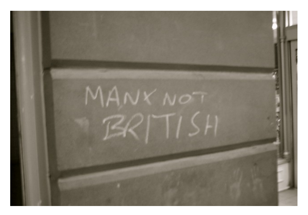
Figure.2: Graffiti displaying Manxness

is perhaps one of the most notable differences between themselves and the English-speaking British, a fact which has recently been expressed on the island through graffiti, both in English and Manx. I myself witnessed a chalk etching on Strand Street in Douglas, making the difference clearly known.