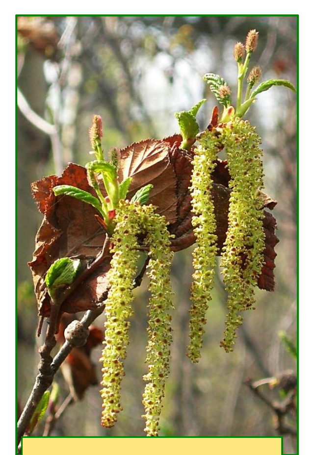
Alnus incana developing male (bottom) and female catkins (top)

systems) synergistically improved plant performance when grown on mine tailings.