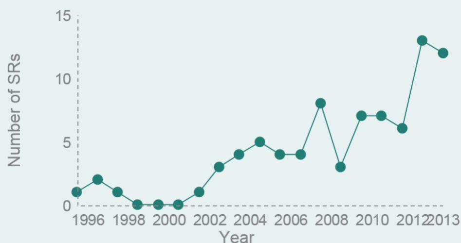
Growth of Systematic Reviews