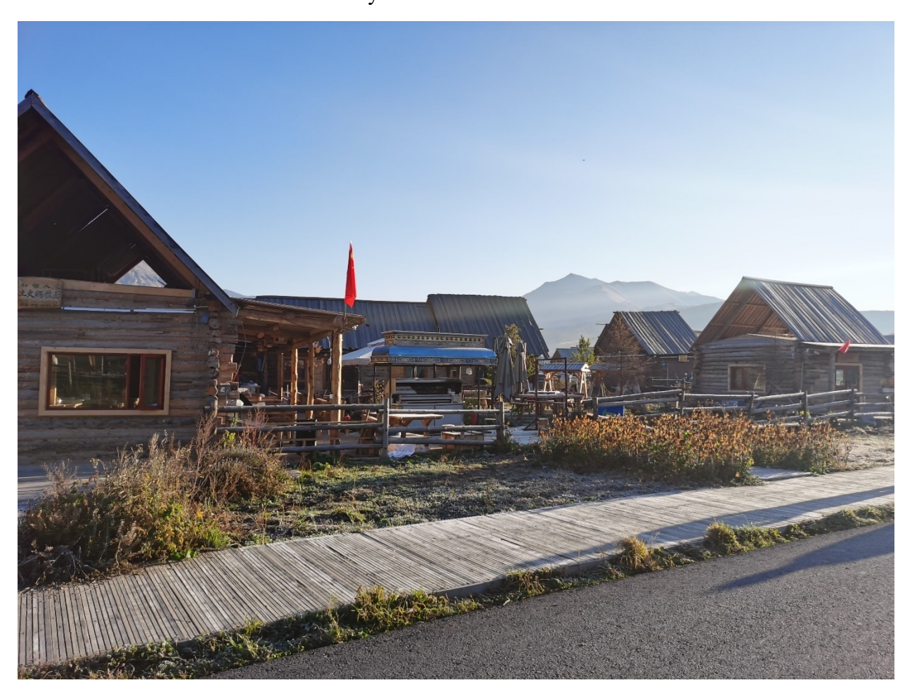
Figure 5. Dispossessed Tuva houses in Hem Village

villagers received environmental education, and their two tractors were expropriated. In the same year, the Altay Prefecture Grassland Department did a grassland survey in Hem, which provides a foundation for regulations and prohibitions on herding activities in the village. <sup>109</sup> In 2017, Kanas Scenic Spot Management Committee started a crackdown on the "illegal activities" in the village which were accused of harming the environment. During the three-month-long crackdown, Chinese authorities bulldozed 212 houses that were privately built without government permission. <sup>110</sup> The Chinese authorities accused those Hem villagers of lacking ecological awareness, illegally occupying collectively owned lands, and building modern-style houses that tarnished the "authentic" style of Hem.