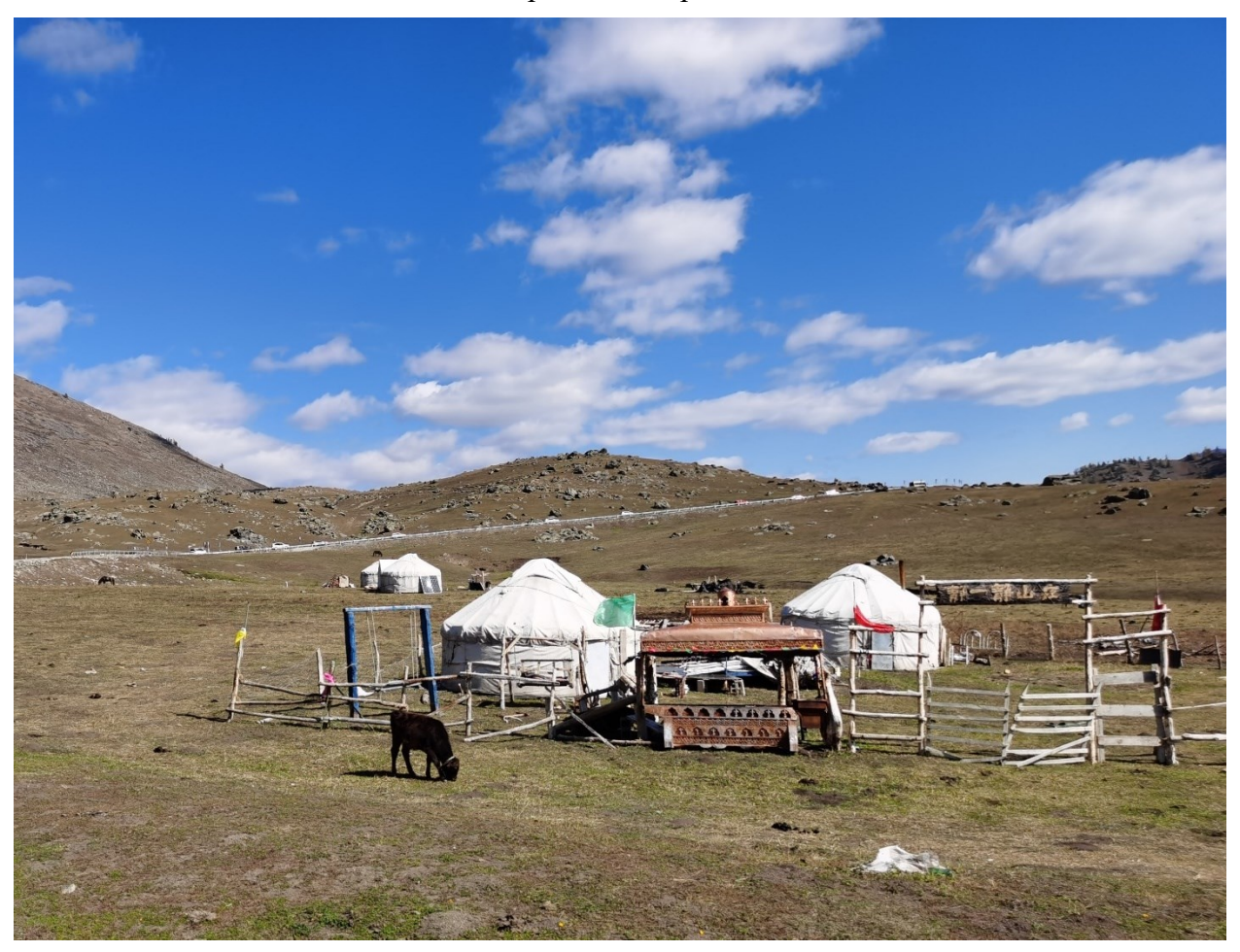
Figure 4. A Kazakh household in Burqin County running Herder's Home Entertainment ( Mujiale )

Kazakh/Tuva land, cultures, and social reproductive space: ethnic tourism.