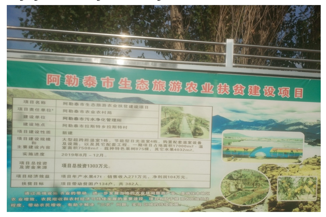
Figure 2. Altay City Ecological Tourist Agriculture Poverty Alleviation Construction Project Between August and December 2019, the project was built by Altay City Agriculture Rural Bureau and Altay City Sewage Purification Management Bureau. The project consists of one large, wide-span greenhouse and four energy-saving sunlight greenhouses. The large, wide-spin greenhouse cultivates tropical and subtropical fruits (e.g., mango, loquat, myrica rubra, pomelo, and banana), which could normally not survive in Altay Prefecture due to its cold, semi-arid climate. Nevertheless, with the help of the greenhouse, the fruits can thrive in suitable environments (i.e., warm temperatures and relatively high humidity). The other four energy-saving sunlight greenhouses cultivate vegetables (e.g., celery, tomato, eggplant, and pepper).

modern agricultural project, named Altay City Ecological Tourist Agriculture Poverty Alleviation Construction Project, in the name of poverty alleviation. The project received a fund of 13 million Chinese dollars and is technically supported by Northeast Ecological Agriculture Development Corporation Limited, a corporation from Jilin Province which specializes in designing and manufacturing multi-functional greenhouses.