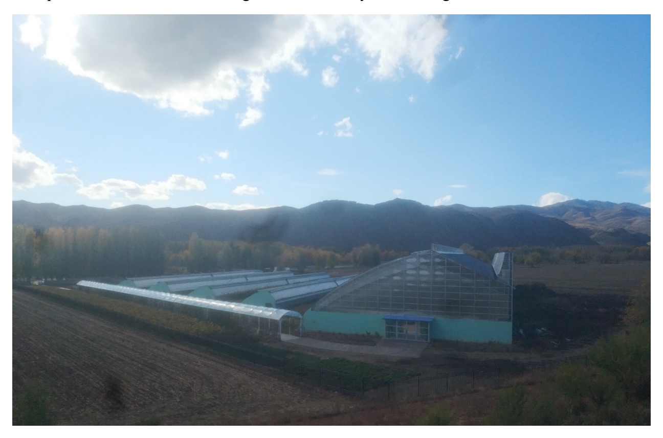
Figure 3. Five greenhouses in the Project

Noticeably, in 2021, the project built 30 more energy-saving sunlight greenhouses, which implies an expansive trend of the modern agricultural industry in the village.<sup>89</sup>