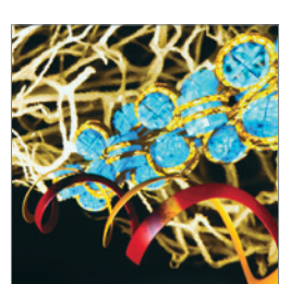
Molecular Biology International

International Journal of Evolutionary Biology