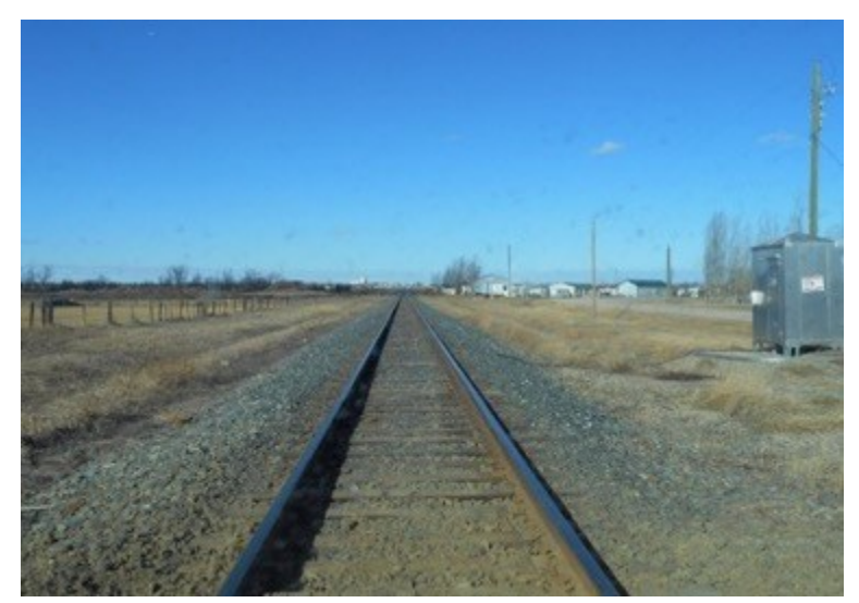
Figure 13. Train tracks

You can make parallels... but there is always going to be something different between rural vs an urban centre. So, these tracks... if you are right on the tracks, they aren't ever going to converge, they look like they're coming close. You are going to come out... you're going to be just as good at IVs, or basic care, or whatever nursing skills you want to attach to it (nursing)... that is the beauty of nursing. It's new every day, even if you think it's not going to be... just getting used to it, not getting in a rut. Being open to that change and just go with it, because in rural there's always going to be something different.