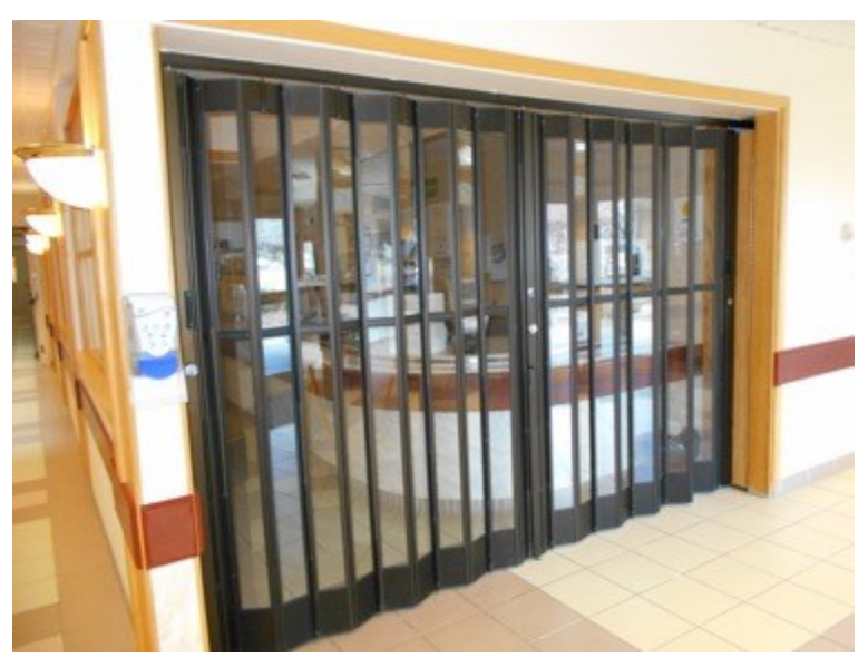
Figure 20. Rural cafeteria

Claire discovered this for herself: "in the rural setting, you can't just zip back home if you forgot something. You kind of have to pack up for the day... just always be prepared. I always bring a little more food, in case I need to stay late."