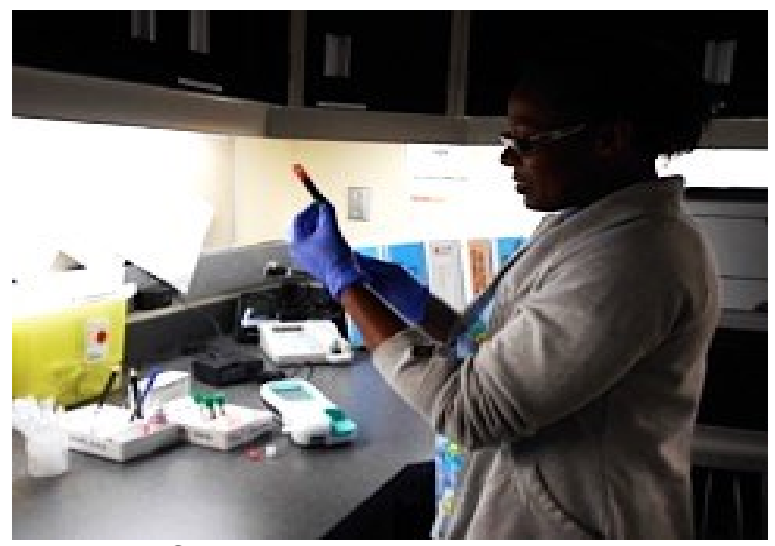
Figure 11. Student conducting laboratory testing