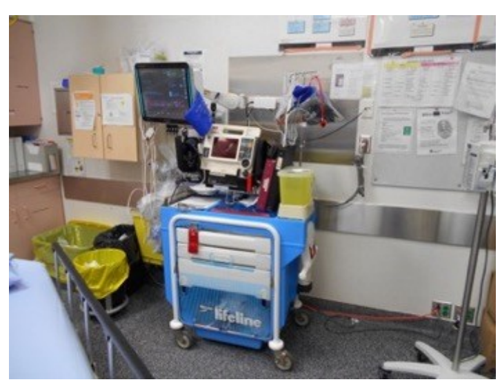
Figure 35. Old code cart

Equipment and space utilization. Throughout the study, the participants took note of limited resource allocation and accessibility. Resources such as crash carts, often found on individual units in larger centers, were limited to one or two per rural site, depending on the size of the facility. As well, the students found that often the carts themselves were older and supplies on the carts were outdated or expired (Figure 35). Daniel said: "It was dated. It was (made) before I was born even! Like late 80s or 90s... so way older material and supplies within the cart."