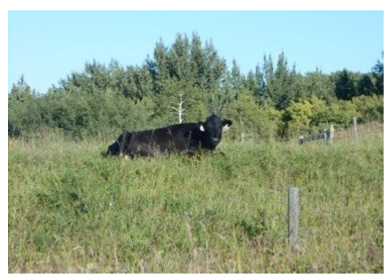
Figure 21. Cow

Landscape. Many participants valued the beauty of the rural landscape (Figure 21). "You always see nice things driving home, from being out of. There's a cow in there, all by himself," said Becky. "It's not a hectic drive... it's just peaceful driving