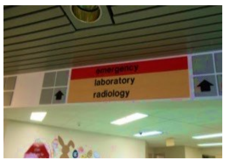
Figure 7. Multiple departments

She found that access to these services was enhanced in the rural hospital, thereby creating "opportunities to do more (patient) education because it's easier to get in contact with the other teams... home care staff actually come over here quite often as well, just to see what is happening with the patients."