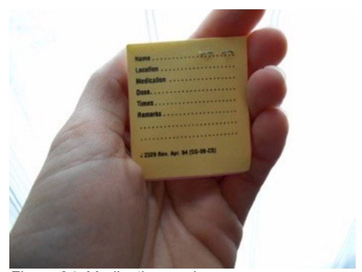
Figure 34. Medication cards

cards has been eliminated in most health care settings more than a decade ago, yet, at her placement site, these were the only method for medication administration. She said: "there's no Pyxis medication system, its hand-copied MARS (medication administration record) on transcribed med-cards, high chance of error, but that's the way it works at our facility". Initially she found this extremely time consuming, requiring one card for each medication. However, by the midpoint of the preceptorship, she found that she was able to safely and correctly prepare and administer all the medications required by the RN with whom she was working. She indicated that her level of efficiency improved in correlation with her growing confidence in her knowledge and skills around this uniquely rural practice.