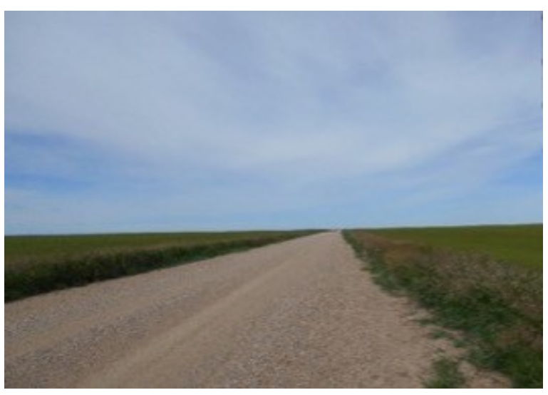
Figure 17. Barren highway

Challenges associated with isolation. The participants described a variety of challenges and limitations they experienced during the rural preceptorship. Some challenges pertained to the isolation of rural life and the cost of travel to rural communities. Sarah (faculty advisor) photographed an image of a barren highway to illustrate her perspective on rural isolation: "see the road? I don't see any help there. I don't see anything. There's no traffic signs, no stop signs. There's nothing—just nothing (Figures 17, 18)."