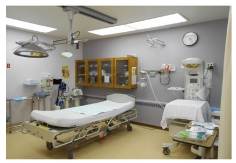
Figure 37. Single labor and delivery room

This scenario is not uncommon in labor and delivery nursing. However, rural nurses are more likely to be working alone or with minimal support, thus requiring advanced knowledge, skills and critical thinking in unexpected situations. This example speaks not only to how nursing staff make do in rural practice, but also to the scope and unpredictability of learning and working in rural settings. Adequate preparation, in terms not only of education but also of confidence and competence, is thus vital to successful outcomes. James observed that faculty advisors should be proactive in alerting students to the realities of rural practice. "You have to prepare students," he said. "They've got to be flexible."