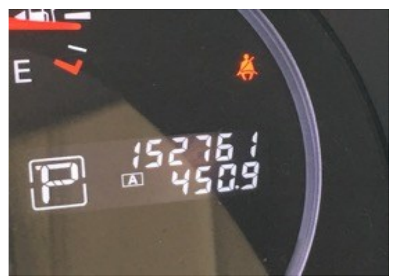
Figure 27. Kilometers

While winter weather was not a factor, the students encountered a range of other travel-related challenges. Ava learned the hard way about the unpredictability of fuel prices in the countryside. "The very last day, when I was driving into the city... I had been filling up, and it was like 94.9, [when] it was like 82.5 in the city, and I had thought (sigh) it would be cheaper rural (Figure 28)," she recalled ruefully. "I didn't even pay attention... and I had to fill up all the time because I was there so often."