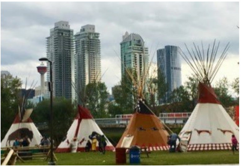
Figure 8. Rural vs Urban

Cultural contexts. Rural communities are steeped in tradition and cultural symbolism. The following image (Figure 8) exemplifies the juxtaposition of the rural versus urban themes that emerged from the findings representing the dichotomy of urban—rural life and capturing an example of cultural identities that are uniquely prominent in many rural communities.