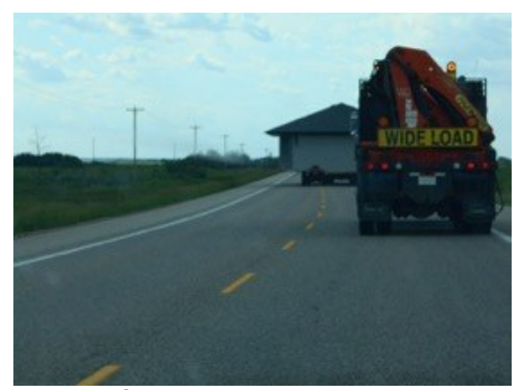
Figure 30. Obstacles

Obstacles came in all shapes and sizes, and could arise at any point along the route, as Ava discovered on the way to her shift: