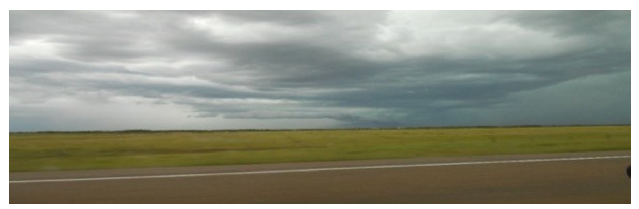
Figure 23. Approaching storm

Jenn photographed an approaching storm (Figure 23), saying, "I just thought it was pretty with a storm coming in... the vastness of it. You drive forever and there is nothing there. Not even a car, horses, animals or anything. Just empty space... there's not a soul out there."