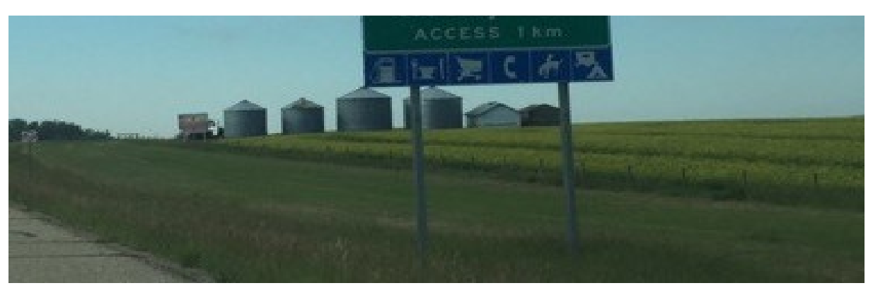
Figure 39. Road sign

Daniel photographed a road sign (Figure 39) outside the community, indicating its amenities, one of which was a rodeo. "There's three hundred people [in town]," he remarked, "but then [with] the rodeo, [the] population increases—more than twice or three times as many people. It just brings the whole town together." Daniel described this as a strength associated with living in this small rural community.