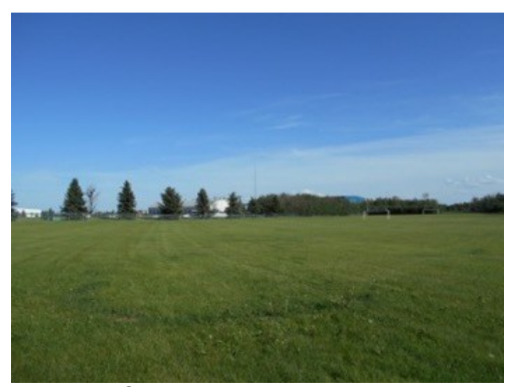
Figure 24. Green space

She said: "I felt like, this path, this greenspace...I have the time before I go... I can just walk there." Not only did she not rely on her car as much in her situation, but this walking path provided a natural opportunity to prepare for the day ahead and reflect on the events of the shift she left had just completed.