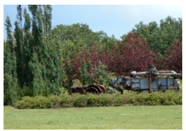
Figure 2. Tractor sculpture

Hannah photographed a sculpture of a tractor (Figure 2). She thought the sculpture represented a way of life that was "emblematic of the town and what's around it."