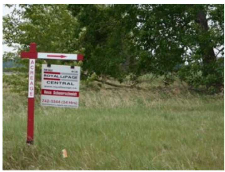
Figure 40. For sale

Becky expressed concern regarding the challenge of recruiting and retaining nurses and other health care professionals, noting that the community showed signs of abandonment. "There's lots of run-down things... [and] more and more For Sale signs," she observed. "Lots of people are moving away from rural and into the more urban centers (Figure 40)." The exodus of long-time rural residents potentially compounds the