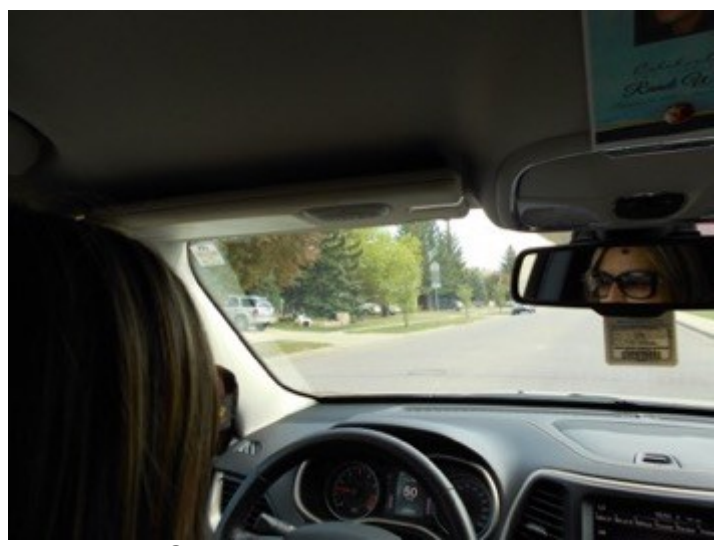
Figure 25. Carpooling with colleagues

"If I had some anxiety, or one of my colleagues had some anxiety about an issue, we used that time to be able to talk and debrief and reflect," she recollected. "By the time we got to the site, we felt better."