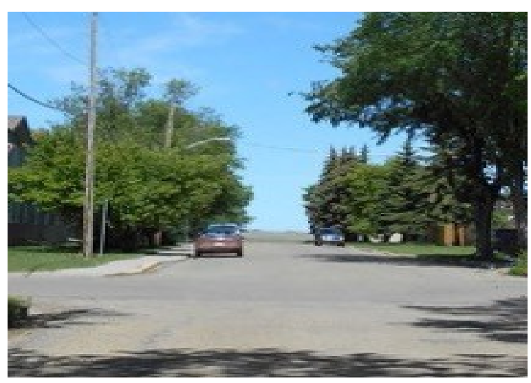
Figure 18. No road signs