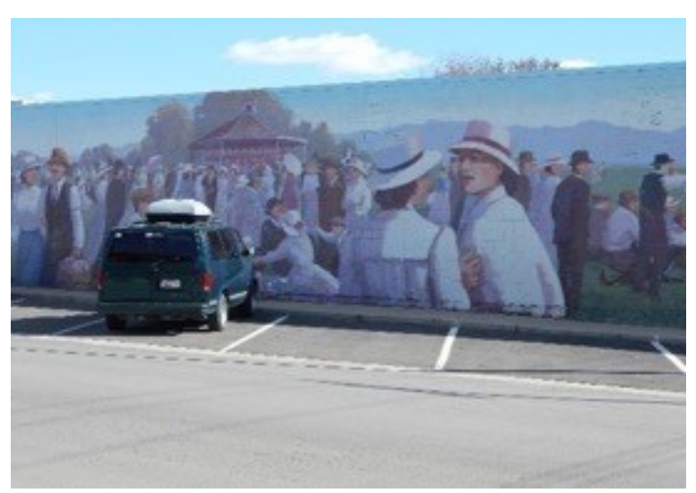
Figure 1. Mural

Hannah photographed a sculpture of a tractor (Figure 2). She thought the sculpture represented a way of life that was "emblematic of the town and what's around it."