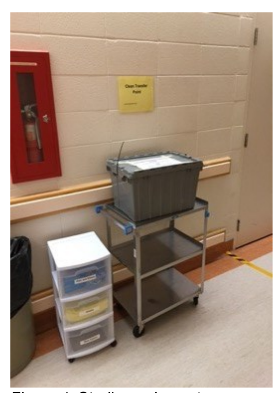
Figure 4. Sterile equipment

Daniel was impressed by the degree of trust he observed both in the rural community and the health care site, photographing recently sterilized equipment and instruments dropped off at a designated spot in a common hallway (Figure 4).