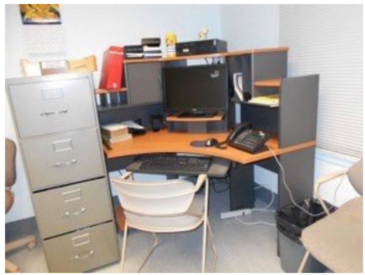
Figure 32. Old computer

Technology. The participants confronted a variety of technological challenges in the rural communities and health care sites. Malfunctioning or inaccessible computers were common. The few computers available for staff use were typically dated and slow.