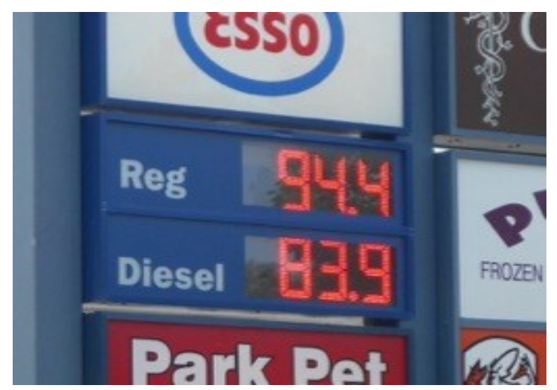
Figure 28. Fuel prices

While winter weather was not a factor, the students encountered a range of other travel-related challenges. Ava learned the hard way about the unpredictability of fuel prices in the countryside. "The very last day, when I was driving into the city... I had been filling up, and it was like 94.9, [when] it was like 82.5 in the city, and I had thought (sigh) it would be cheaper rural (Figure 28)," she recalled ruefully. "I didn't even pay attention... and I had to fill up all the time because I was there so often."