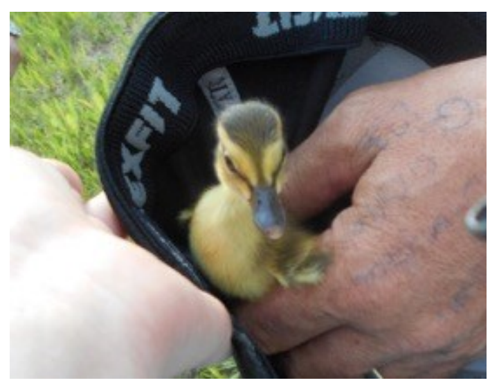
Figure 31. Baby chicks

I almost hit these three baby chicks. I was driving and turned onto the street the hospital is on. I had to stop so I didn't hit them...they were underneath my car...just sitting by my tire...this farmer stopped and...helped me shoo them out, and put them in his hat. (Figure 31)