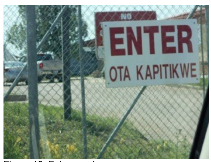
Figure 10. Entrance sign

Stacey (faculty advisor) described the importance of recognizing and investing in the cultural context of the community. She shared an image of the entrance to one of the health care settings that was written in Cree and English (Figure 10).