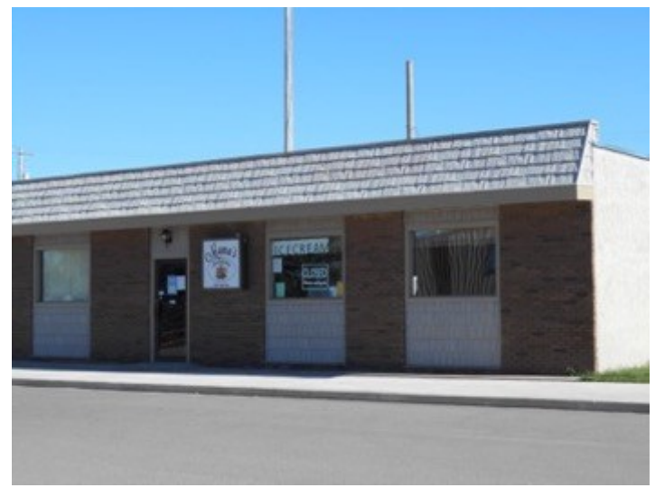
Figure 3. Local restaurant

Robert found that a number of immigrants had opened restaurants (Figure 3) in some of the rural communities he visited as part of his preceptorship placement. Robert