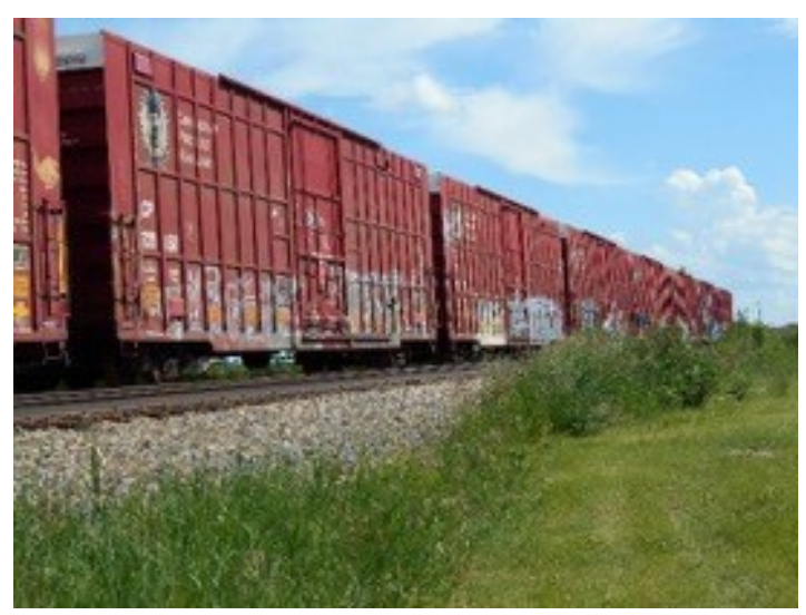
Figure 29. Train

Jenn captured an image of a train (Figure 29) passing through one of the rural communities, musing, "what happens when a train goes by, and you have someone that needs to get in or out of town, because there's only the main highway? ...I thought that could be a really interesting challenge."