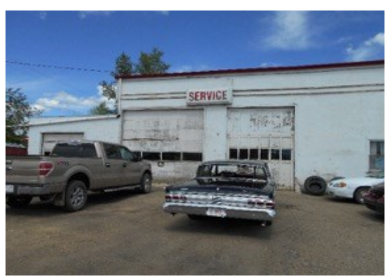
Figure 33. Old and new

Becky found certain patient tests and services, typically provided in urban hospitals, were unavailable in the rural health care setting. "We don't have certain [treatments or procedures] here, so [patients] would have to travel to get it... if they need a cath (sic) lab, we don't have one so they are going to have to go up [to the city]." Jenn's perspective of such challenges changed, however, as the term progressed. Near the end of the preceptorship she found she was "finding new ways of doing things [and] making the old things work, like an old car at a service station (Figure 33)."