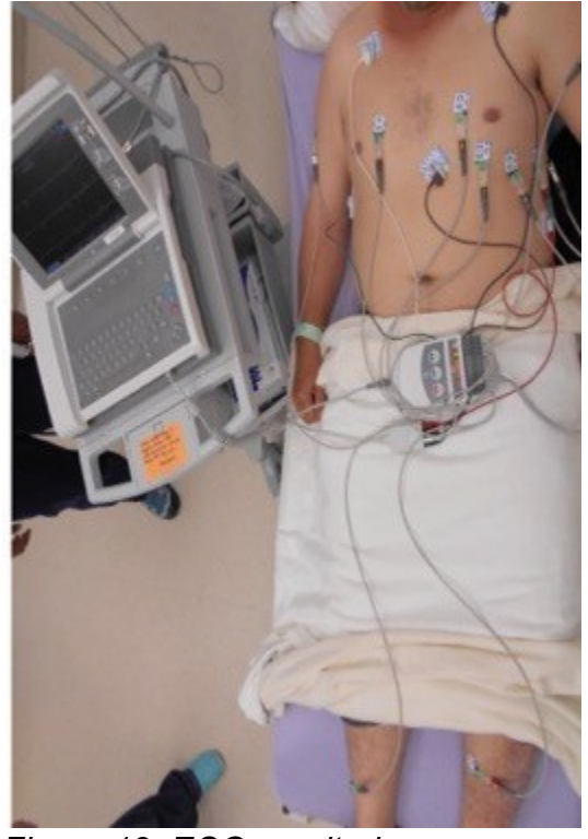
Figure 12. ECG monitoring

In most cases, laboratories were limited to daytime hours, although some settings offered evening hours and availability on call at night. "The lab is only open until 2300 and doesn't open again until 0600," said Daniel, "and there have been a few times during the night [when] we have had to call in someone from the lab, to get a test