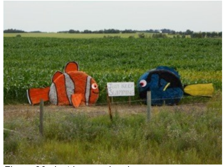
Figure 26. Just keep swimming

Stacey (faculty advisor) described a unique image she captured on the side of the highway. She described it as "just keep swimming" (Figure 26). These figures