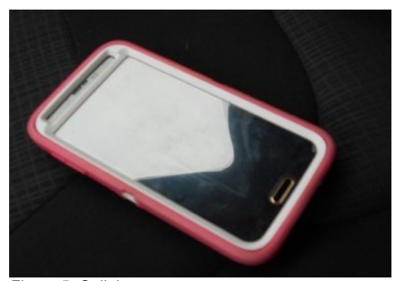
Figure 5. Cellphone

This is critical during preceptorships, and exacerbated by the nature of rural practice. Resources such as Skype, Facetime and video-conferencing enabled her to mitigate this risk and assess the relationship between student and preceptor which is essential for student learning and to the success of the preceptorship.