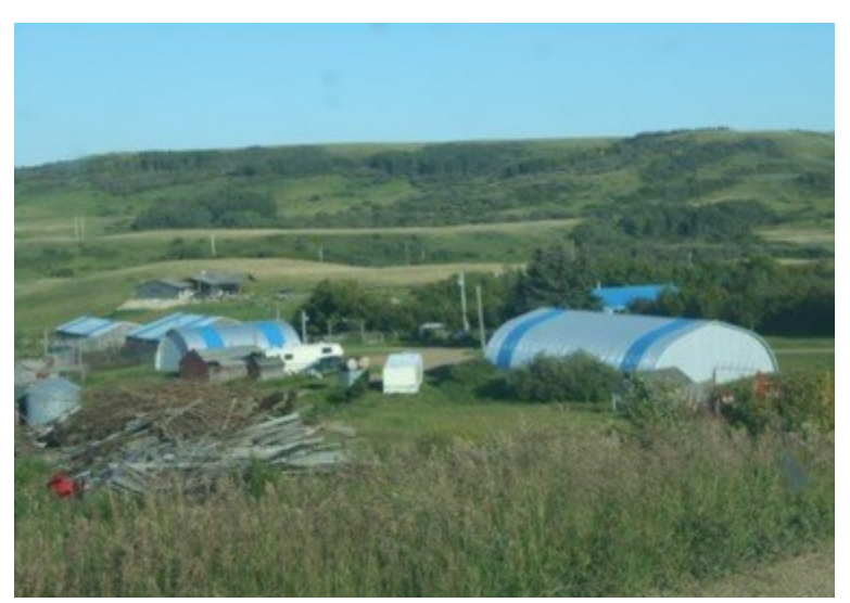
Figure 38. Rural homestead

From the perspective of a faculty advisor, Stacey described how this sense of community and helping attitude extends beyond the health care setting. "Tight knit rural communities can offer support and act as a resource contributing to individual and community resiliency." She shared an image of a rural homestead with two residences (Figure 38).