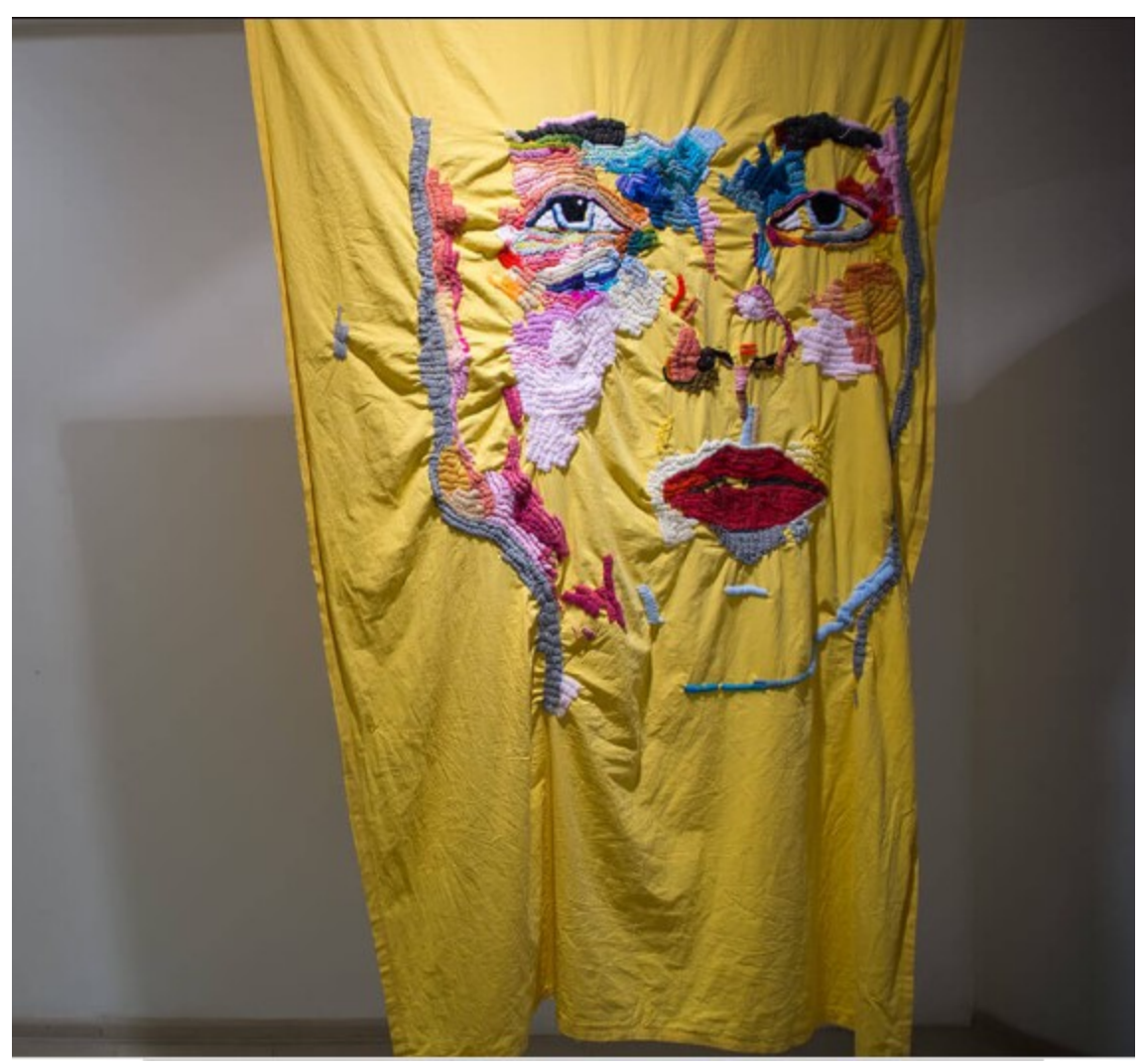
3.1 Valentyna Petrova, Self-Portrait, 2017, Tapesty and Performance. Used with permission from the artist.

The material interaction of the threads and the fabric brings the portrait to life, increasing its dimensionality and presence in the gallery. The process of poking the material and pulling through the thread has caused the yellow sheet to pucker and pleat between the planes of colour, creating the effect of wrinkles and dimples on the surface of the face. The folds and creases of the unpressed sheet accentuate this effect, simulating fine lines and pores. Upon the surface of the fabric, the planes of embroidery create the illusion of depth, moulding a face from their undulating stiches. The embroidery is most dense in the upper plane of the image around the