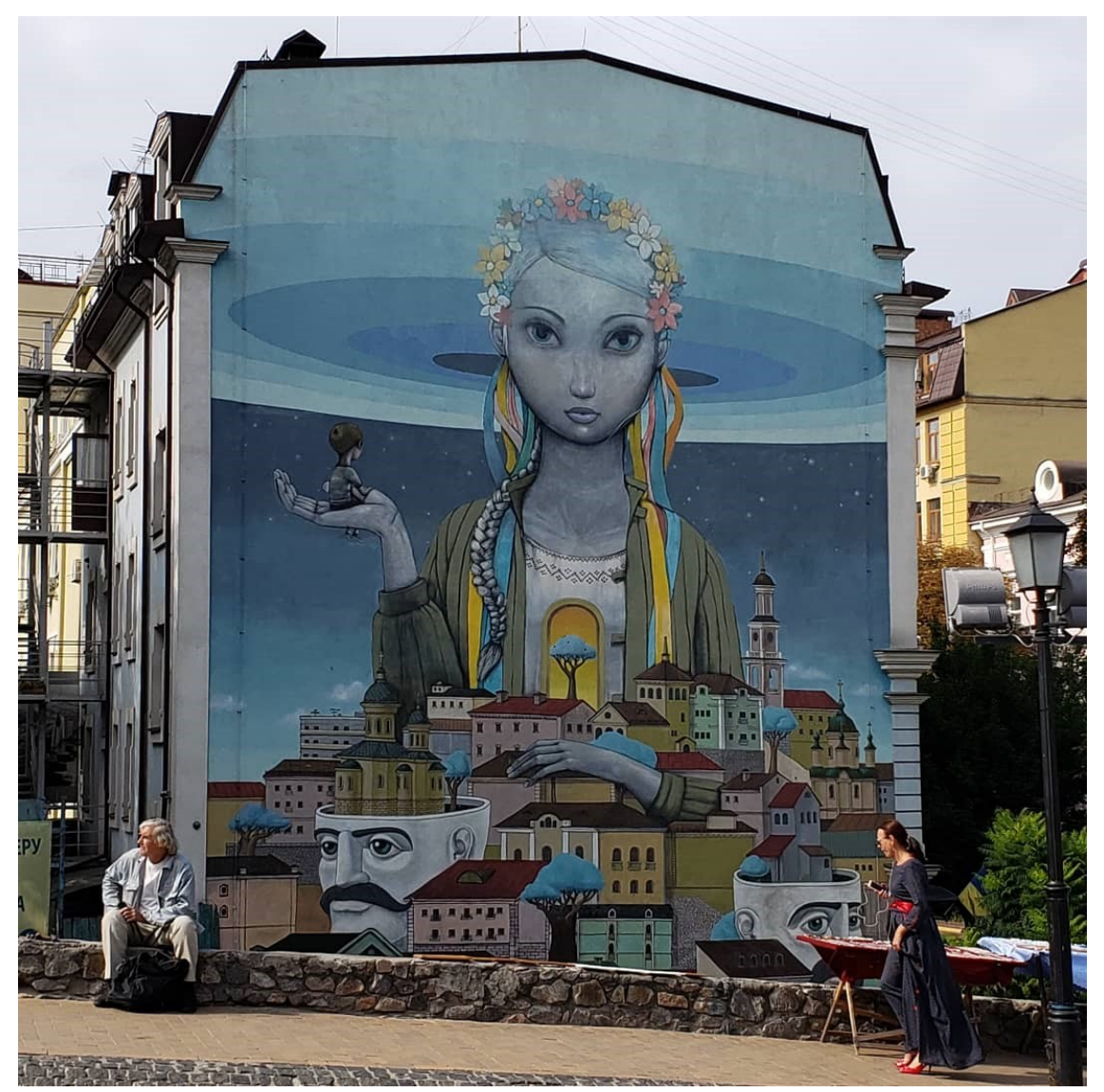
2.4 Kalyna Somchynsky, Mural on Andriyivskyy Descent, Kyiv. August 2019. Kyiv, Ukraine.

to be emerging from the heads of two men, suggesting that the foundations of the city have emerged from the minds of men. One of the woman's arms reaches around the city, seemingly protecting it, while in the other a young boy sits perched in her hand. The mural depicts a contemporary reincarnation of the berehynia promoting and protecting Ukrainian culture while also inspiring a new generation of men who will continue to build the city, and by extension the nation.