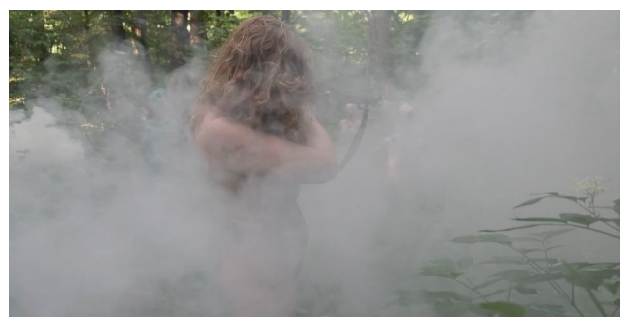
Figure 1.3 Maria Kulikovska, Let Me Say: It's Not Forgotten, 2019, Video Performance, Still, full video available on artist's website, <u>https://www.mariakulikovska.net/en/let-me-say-it-is-not-forgotten</u>.

suggest the passage of time as linear demarcations of past, present, future, but rather collapse time suggesting that the past, present, and future are bound into one another within the realm of memory. The continual sound of birds and sight of mist are circular elements within the form of the video that provide a setting for the narrative to take place while remaining present as the action changes. They index an ever present past that cannot be escaped or forgotten. Even within the recesses of memory, the past and present collapse into one another as evidenced by the reenactive quality of the video-performance: the video performance makes explicit the implicit experience of the past being re-lived and encountered continually.