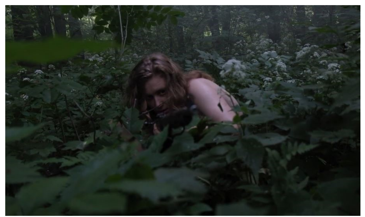
Figure 1.4 Maria Kulikovska, Let Me Say: It's Not Forgotten, 2019, Video Performance, Still, full video available on artist's website, https://www.mariakulikovska.net/en/let-me-say-it-is-not-forgotten.

The discourse on memory across disciplines is immense and within Ukrainian studies memorialization is an increasingly contentious subject.<sup>91</sup> In Ukraine, debate often arises regarding how to remember the history of World War II and the legacies of Ukrainian partisan organizations such as The Organization of Ukrainian Nationalisms (OUN) and the Ukrainian Insurgent Army (UPA), remembering revolutions, coming to terms with the Soviet period following the collapse of the Soviet Union, and processes of "decommunization".<sup>92</sup> As