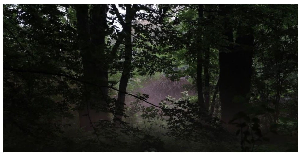
Figure 1.5 Maria Kulikovska, Let Me Say: It's Not Forgotten, 2019, Video Performance, Still, full video available on artist's website, https://www.mariakulikovska.net/en/let-me-say-it-is-not-forgotten.

The viewer is invited reflect on their past and the past of Kulikovska, as indicated by the ongoing presence of the mist and the sounds of birds, that they have now embodied into their own memories. They must decide how they will incorporate the past into their future and the future of those they interact with—a future that is open to numerous possibilities.