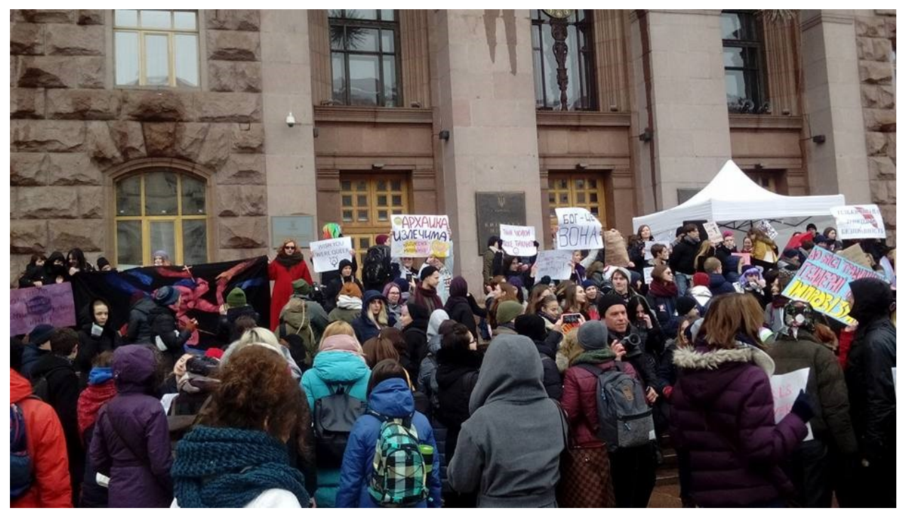
2.2 Photo by Jessica Zychowicz, March 8, 2018 Women's March Kyiv. Photo used with permission from the photographer.

The controversy surrounding the banner engages the relationship between feminism, nationalism, and militarism in a country engaged in military conflict. The destruction of the banner raises the question: how can feminism engage in this dialogue and respond to the destructive force of far-right ideology? Kavelina would elaborate on this relationship the following year with another banner for the 2019 March 8<sup>th</sup> demonstrations similarly featuring a naked woman as the central figure. In this image, the central female figure does not show any traces of youth. This gaunt and skeletal woman lays across the centre of the banner actively birthing several infants with the faces of grown men. These men evolve into soldiers as they ascend from the bottom to the top of the picture plane and threaten the woman with a rifle, subverting the conventional mother-son relationship. The tension between the female figure and male soldiers is further exacerbated by the woman's contradictory actions as she feeds the soldiers with one hand and simultaneously points a rifle at them with the other. Her labouring body produces these figures who she both attempts to sustain and eliminate; they physically