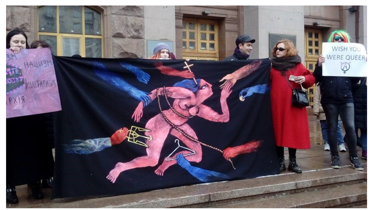
2.1 Photo by Jessica Zychowicz. March 8, 2018 Women's March Kyiv. Used with permission from the photographer.

background. From the margins of the banner hands holding various objects pull and prod the woman: a coat hanger, a cross, an egg, a piece of rope, and the Ukrainian trident (тризуб). These various emblems assaulting the woman represent social and political institutions that have continued to negatively impact the freedom and well-being of women in Ukrainian society. In the context of an International Women's Day march, this image explicitly illustrated what the demonstrators were arguing for and against: for a woman's right to exist free of oppression and against institutionalized forms of sexism and discrimination.