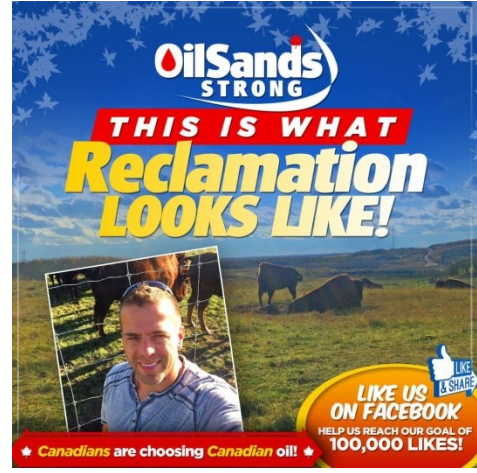
Figure 4: Image shared on OilSands Strong Facebook page.

Tours of the oil sands, a promotional venture in themselves, reinforce the significant role that the wood bison play in the reclamation imaginary as testaments to its success. In this space the Romantic tourist gaze collides with its extractive mirror-image. Describing her experiences during a tour of this reclamation site, Shannon Walsh quotes a Newfoundlander guide in the opening pages of her article "The Smell of Money: Alberta's Tar Sands": "As long as the buffalo