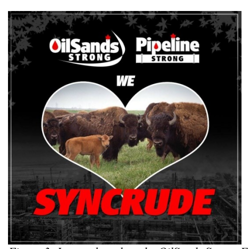
Figure 3: Image shared on the OilSands Strong Facebook page.

I would, however, like to push Shukin's observations here further and suggest that while Syncrude's corporate iconography is deeply attached to both the bison and reclamation in general, as the image circulated on Facebook by the petroturfing group Oil Sands Strong demonstrates (see Figs 1 and 2), restricting the discursive power of the image of the wood bison to Syncrude alone overlooks the ways in which reclamation projects serve the aim of positively framing the oil sands in general . Indeed, in the wake of Stephen Harper's national agenda to establish Canada as an energy superpower (discussed in detail in Chapter 3), it is clear that the oil sands operate as an ideological totality beyond the sum of its individual corporate parts. Petroturfing, which sees no allegiance to a particular energy company but instead to the oil sands as a project in the collective national interest, is evidence of this understanding.