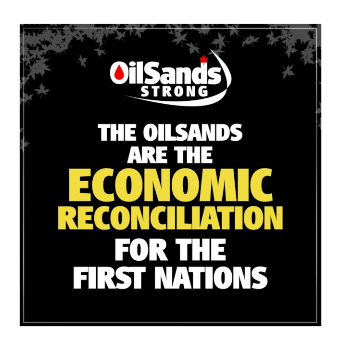
Figure 2: Image Posted by @OilSandsStrong, Facebook, 4 December 2017

Like the neoliberal undercurrents of the kinds of feminism found in organizations such as YWE, such claims as those of British Columbians for Prosperity, Canada Action, or Oil Sands Strong surrounding First Nations support of oil sands developments are made possible and legitimized through the neoliberalization of Indigenous interests and cultures in Canada. This neoliberalization occurs through a number of material and cultural registers, especially related to regimes of private property and the politics of Indigenous land relations. In "Racial Extractivism and White Settler Colonialism: An Examination of the Canadian Tar Sands Mega-Projects," Jen Preston argues that "The Athabasca, Cold Lake and Peace River tar sands mega-projects and associated discourses of 'natural resource' extraction reveal how the character of contemporary white settler colonialism has changed in relation to the nation-state's neoliberalization" (354), part of which is a process of what she terms "racial extractivism" (356). "Racial extractivism," she writes, "positions race and colonialism as central to extractivist projects under neoliberalism and underpins how these epistemologies are written into the economic structure and social relations of production and consumption" (356). Such racial extractivist impulses are replicated