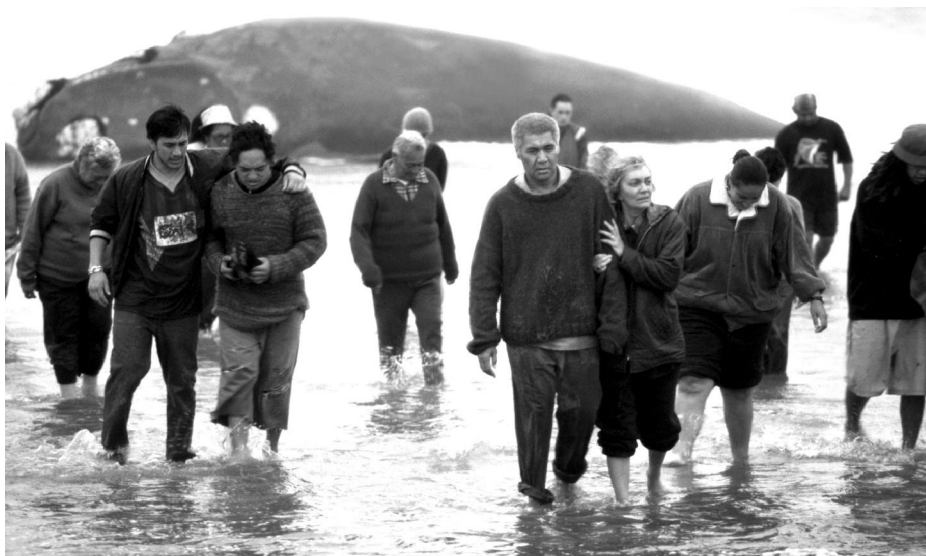
PHOTO 2. Villagers at whale stranding.

kinship relations, fossilized ceremonies, and traditions of totemism (Kuper 1988, 7, 234–235). The Whangara they see is not just an invented community bonded through intimate connections with spiritual forebears, shared myths, and memories, but also accompanied by real-world referents such as the marae and the whales themselves, simulating a Māori rural coastal reality. Importantly, to paraphrase Benedict Anderson, it is not the falsity or genuineness of communities that should be distinguished, but rather how they are imagined (1981, 6).