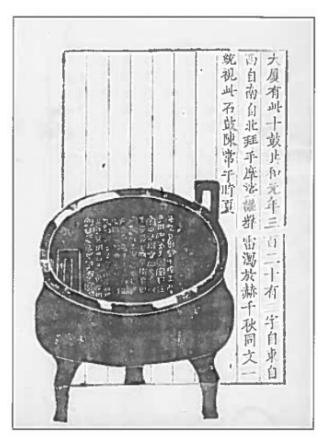
Figure 7. A Ding vessel in Chu Jun 褚峻 and Niu Yunzhen 牛運震, Jinshi tu 金石圖 (Bronze and stone illustrated), vol. 1, 1743.