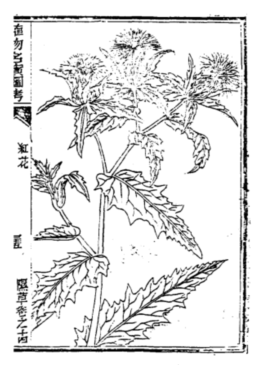
Figure 8. Honglan 紅藍 in Wu Qijun 吳其濬, Zhiwu ming shi tu kao 植物名實圖考 [Illustrated Research of Names and Facts of Plants], vol. 25, 1848.