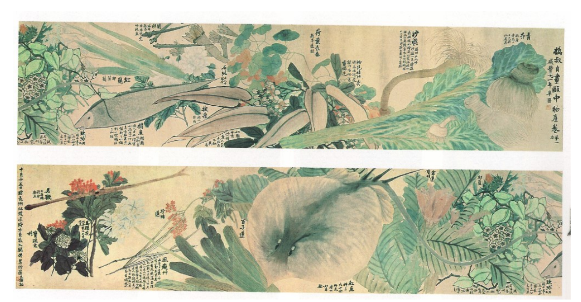
Figure 1. Zhao Zhiqian 趙之謙, Ouzhong wuchan juan 甌中物產卷 (Natural Products of Wenzhou), 1861, ink and color on paper, 35.6 x 290 cm. Beijing: Rongbaozhai. As Reproduced in Liu Jiu'an 劉九庵 ed., Zhongguo wenwu jinghua daquan shuhua juan 中國文物精華大全. 書畫卷 (Selection of Chinese cultural relics: calligraphy and painting). Taipei: Shangwu yinshuguan, 1995, 450.