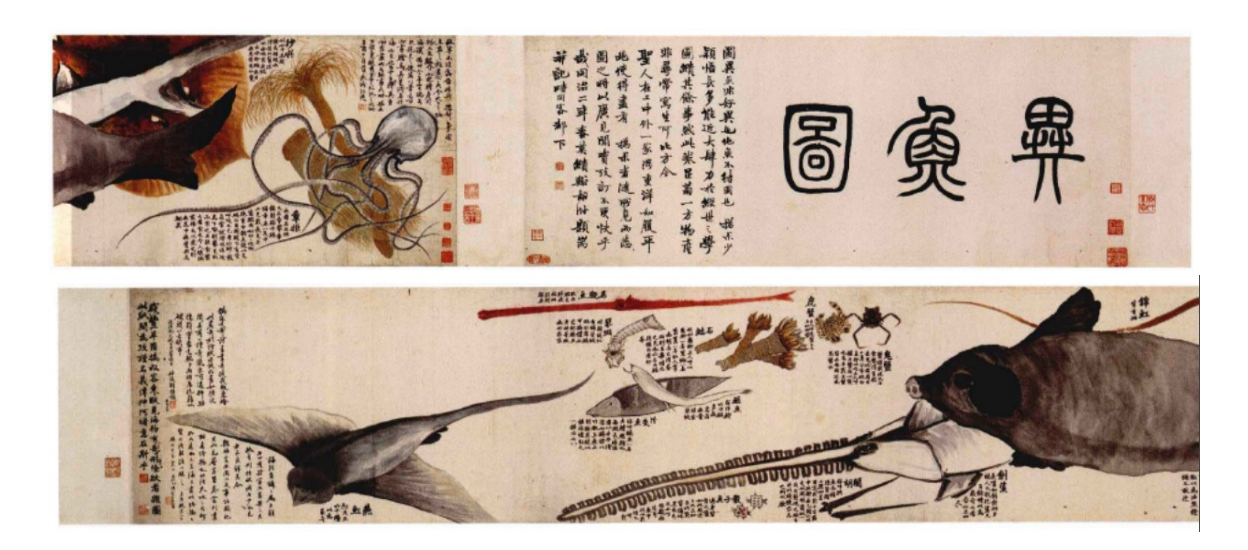
Figure 2. Zhao Zhiqian 趙之謙, Yiyu tu 異魚圖 (Scroll of Strange Fishes), 1861, ink and color on paper, 35.4 x 222.5 cm. Private Collection. As Reproduced in Chen Zhenlian 陈振濂 et al., Xiling yinshe xinmao qiuji yaji zhuanji 西泠印社辛卯秋季雅集专辑. Hangzhou: Xiling yinshe, 2011, 40-41.