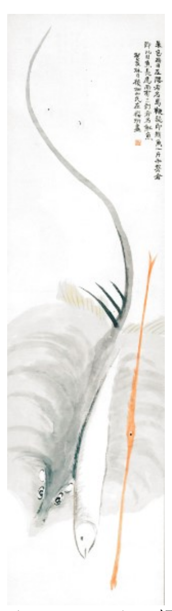
Figure 6. Gu Dachang 顧大昌, Oumin qiwu tu 瓯閩奇物圖 [Exotic Fish, Strange Creatures of Zhejiang and Fujian], 1863, hanging scroll, ink and color on paper, 116.1 x 31.6 cm. Kaohsiung: Kaohsiung Museum of Fine Art. As reproduced in: Yang et al., Shibian, xingxiang, liufeng , vol.1, cat. 1110.