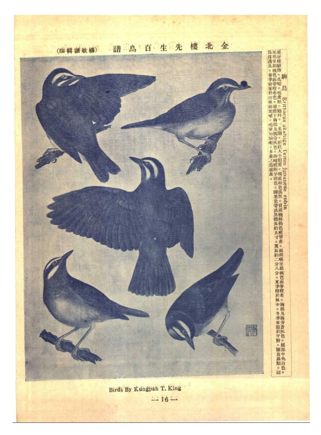
Figure 12. Yang Min 杨敏, Juniao 駒鳥 [Erithacus akahige Temm Japanese Robin] in Jin Beilou xiansheng bainiao pu 金北樓先生百鳥譜 (Album of a hundred birds by Mr. Jin Beilou). As reproduced in Hushe yuekan , 56 (1932): 16.