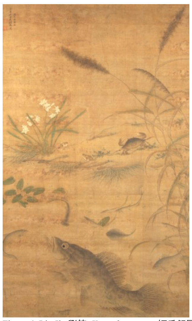
Figure 4. Liu Jie 劉節, Yi gui hexie tu —鱖禾蟹圖 [Flower, Fish and Crabs], Ming dynasty, 15<sup>th</sup> century, hanging scroll, ink and color on silk, 175.9 x 107.3 cm. New York: The Metropolitan Museum of Art.