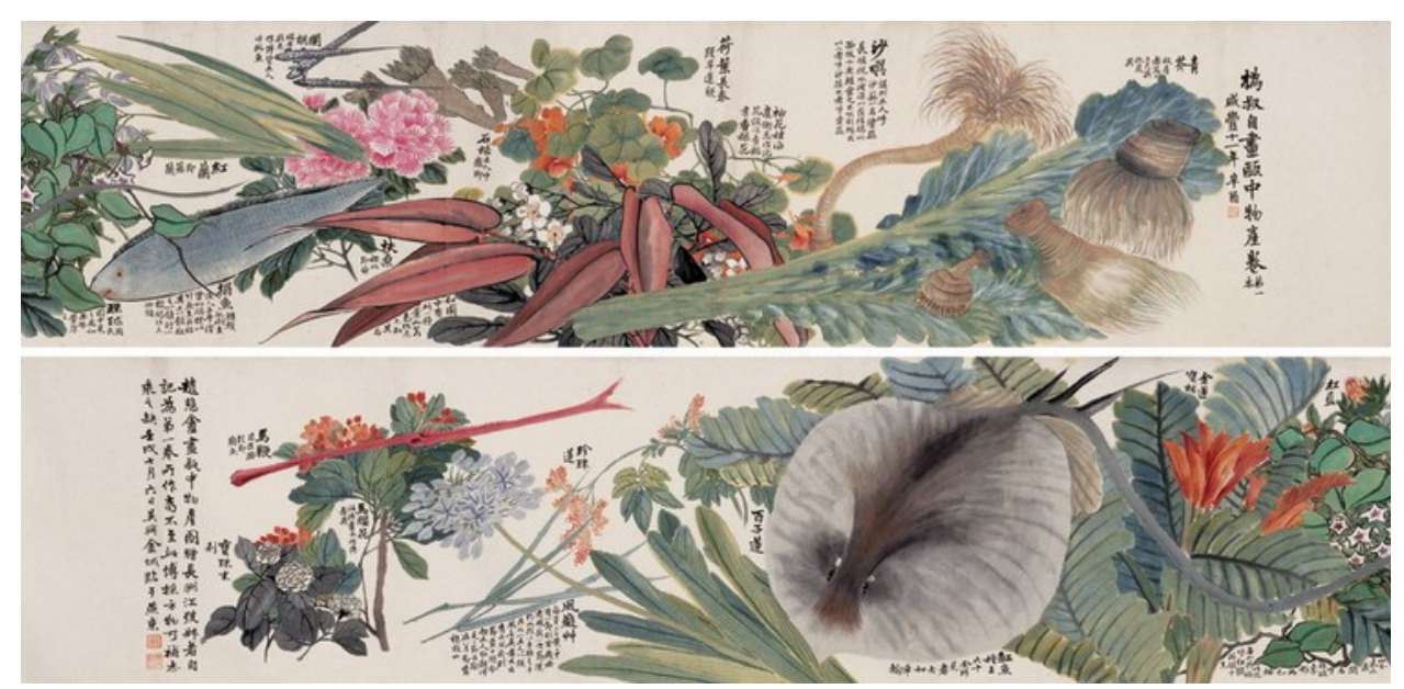
Figure 9. Jin Cheng 金城, Lin Zhao Zhiqian Ouzhong wuchan juan 臨趙之謙甌中物產 卷 (Copy of Zhao Zhiqian's Natural Products of Wenzhou), 1922, ink and color on paper. 39 x 364.5 cm. Taipei: Xizhitang Gallery.