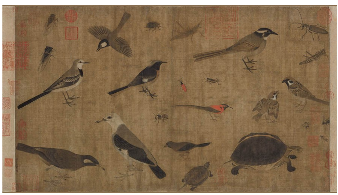
Figure 3. Huang Quan 黃荃, Xiesheng zhenqin tu 寫生珍禽圖 (Rare birds drawn from life), 10<sup>th</sup> century, ink and color on silk, 41.5 x 70.8 cm. Beijing: Palace Museum.