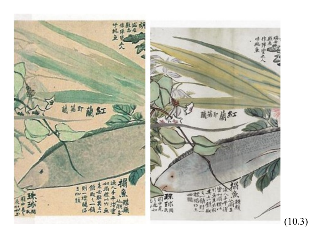
Figure 10. Comparison of Jin's copy and Zhao's original Wuchan scroll