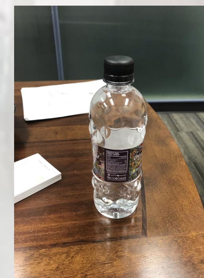
Only 41% of participants reported having daily access to clean drinking water