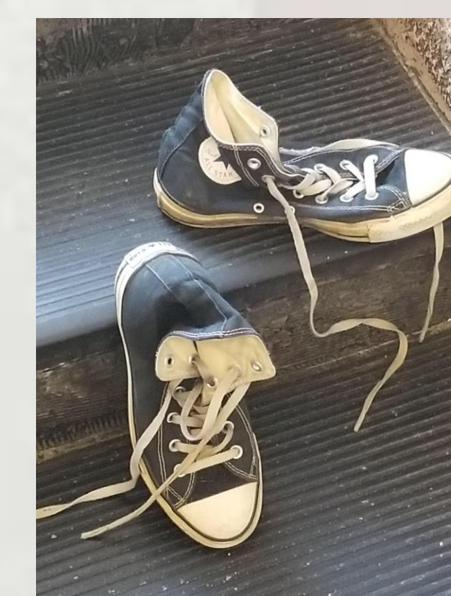
Winter footwear on a -40°C day

38% agreed and 28% strongly agreed with the statement "I sometimes do things I don't want to do to survive"