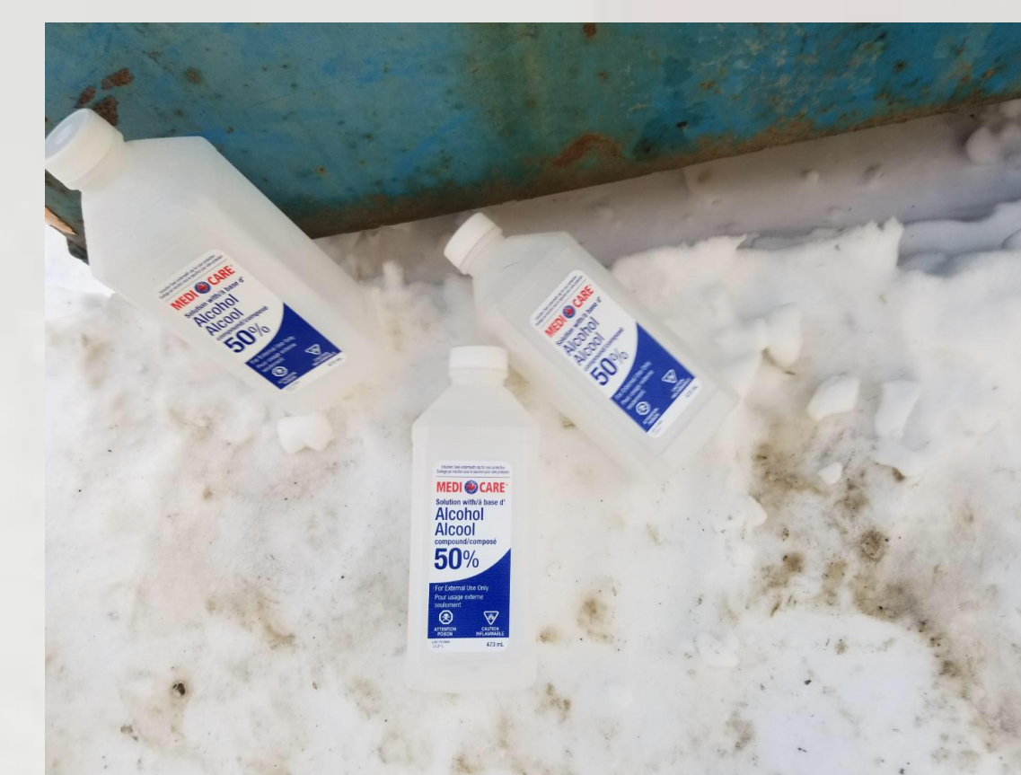
As an emerging escape trend, some youth are drinking hand sanitizer and/or rubbing alcohol