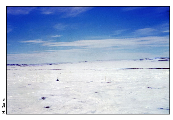
Fig. 5. Snow on 11 June above the main study pond, which is delineated by wooden stakes; the scale is suggested by the rolled-up surveyor's metal tape, about 30 cm in diameter.

The severe conditions and remoteness of arctic areas make all operations there relatively risky, of course. Therefore, field camps were instructed to make scheduled radio contact every day with personnel from the Polar Continental Shelf Project at Resolute. That radio link was sometimes tenuous, in which case our scheduled contact was made through a field camp of geologists on another island who could exchange somewhat clearer transmissions with both Resolute and us. Often, I was the one trying to make contact because my voice was deemed to transmit effectively. When I was told (both then and later) that my voice is distinctive, I hoped that a compliment was intended!