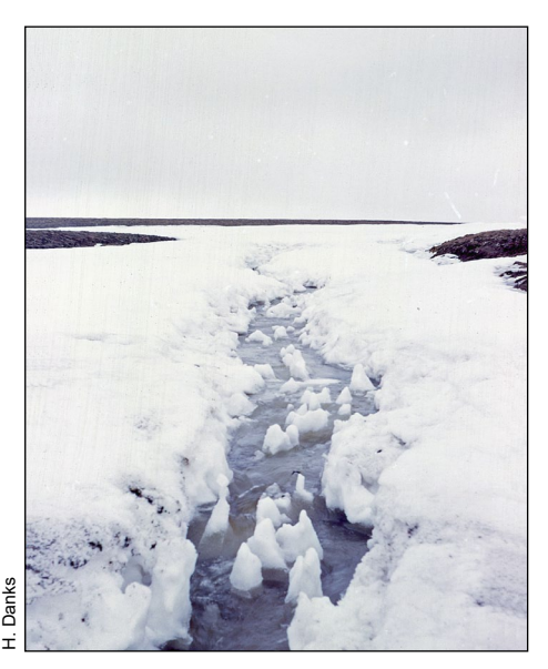
Fig. 1. Meltwater flowing through the top part of the snowpack above a creek (27 June 1969).