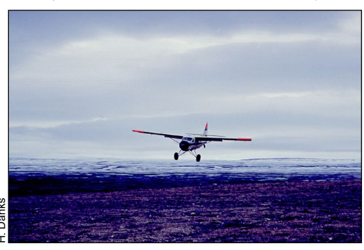
Fig. 4. Single Otter aircraft coming in to land on the camp ridge.

On a few occasions a Single Otter aircraft came to the camp (Fig. 4), for example to pick up two members of the group who left before the others. Normally, the plane landed into the wind near the end of the camp ridge and was stopped almost instantly by the powerful breeze, coming to rest just beside our accommodation. One day, however, the plane arrived when it was unusually