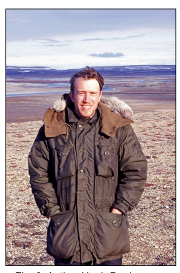
Fig. 8. Author Hugh Danks on Bathurst Island in July 1969.

The cloud and fog persisted. I started to worry about the state of my frozen samples in the cooler, despite the relatively low temperatures and the dry ice that had been added in Resolute. It was possible that the weather would