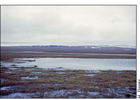
Fig. 6a. The main study pond on 20 June, partly thawed; the thermograph and battery pack can be seen across it.