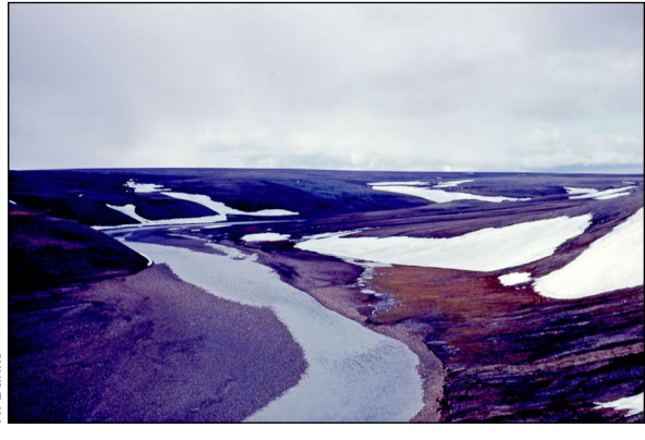
Fig. 7. A reach of the Goodsir river after the peak flow had subsided (10 July).

After crossing the river we explored creeks and other habitats that were previously inaccessible. We had wandered well away from camp to collect in these new areas when a large, white animal suddenly appeared in the distance, and then moved steadily closer. We stopped collecting and, pursued by the animal, hurried back to the safety of camp, crossing the river at the maximum speed that might be considered safe. We rushed up to the top of the ridge and deployed the telescope. As the pale fur of its underside caught the light, we saw that it was not a polar bear but a caribou. These animals are curious, and will approach to see what is going on.