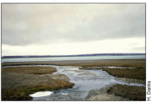
Fig. 3. Lower part of a creek flowing into the sedge meadow, with lake beyond (4 July).

In due course, the softened snow in creeks melted further and water began to flow in the top part of the snow pack (Fig. 1). Within a few days it had cut down to the streambed (Fig. 2). Such creeks supplied water to the wetland (Fig. 3).