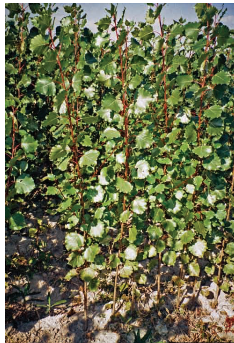
Hybrid poplar plantation in the U.S.

Residual fibre from harvest or silvicultural operations (e.g. thinnings, branches, low-value trees, beetle-killed timber, etc.) could be another source depending on the availability. However, these sources are often not consistently available and are therefore less economically attractive. In addition, forest residue and coarse woody debris play an important ecological role in forests. Trade-off analysis and the ecological implications of using this wood source for ethanol production need to be examined in the context of an integrated resource management approach.