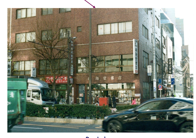
Jinbocho intersection, south side