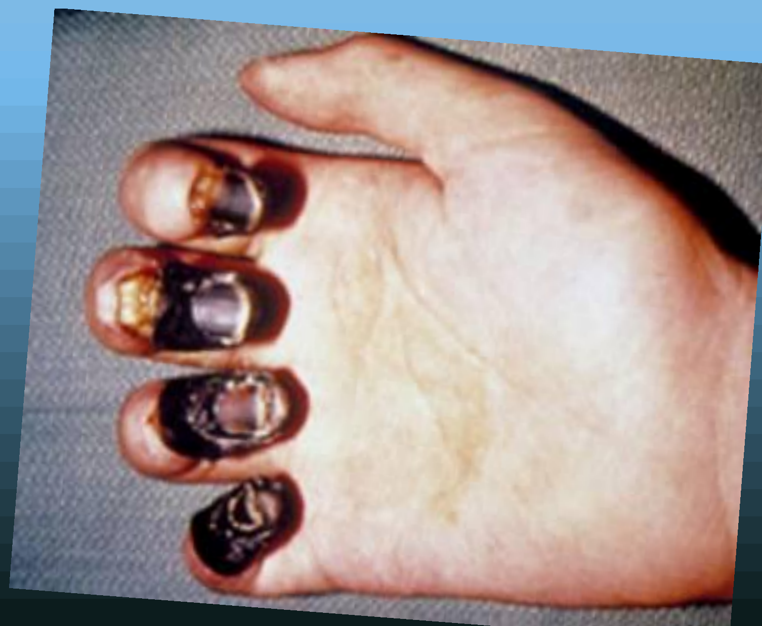
Figure 2- Necrosis of finger tips resulted from septicemic plague