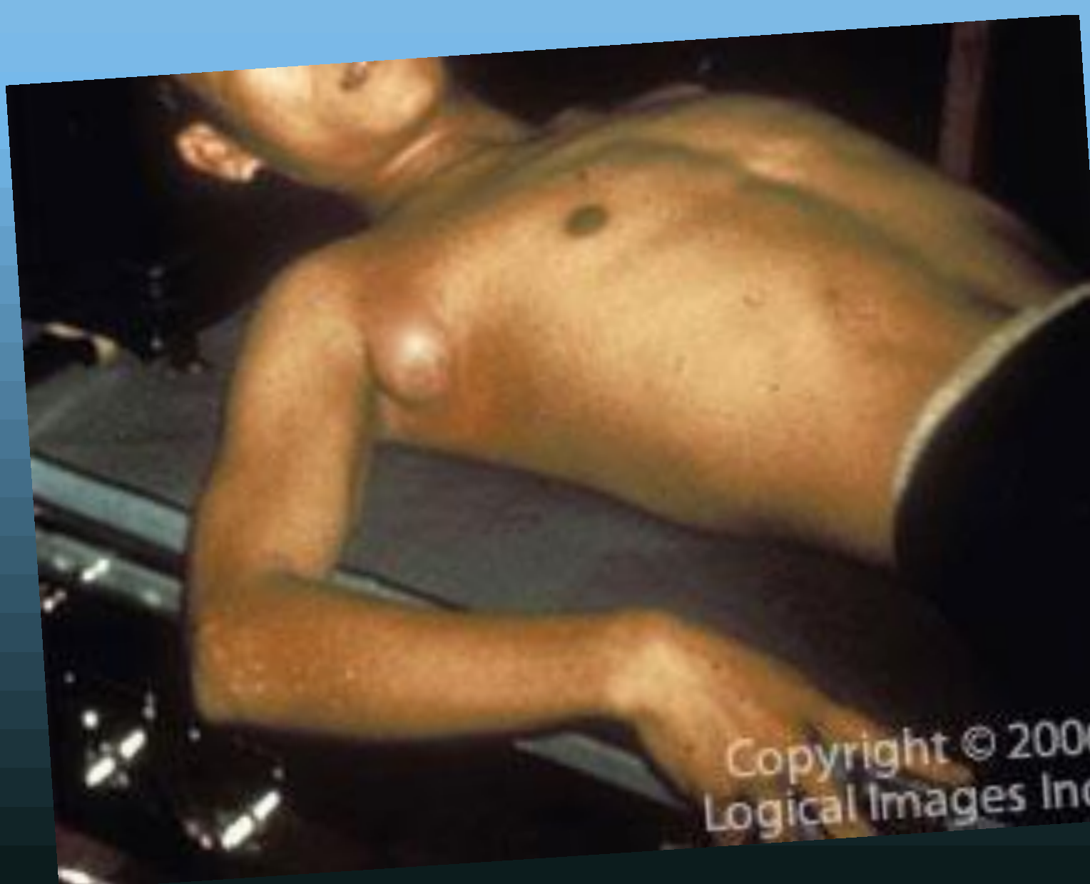
Figure 1- swollen lymph node (bubo) as a result of the bubonic plague http://bashapedia.pbworks.com/w/page/13960223/Bubonic%20Plague