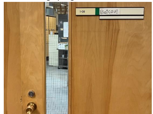
The 'Batcave' in the AgFor basement