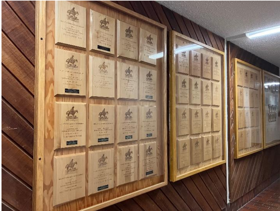
Range Team Awards for 1981 - 2023 need a lot of cabinet space!

Table 1 on the next page describes the consistency of Range Team award wins of the team up until 2023