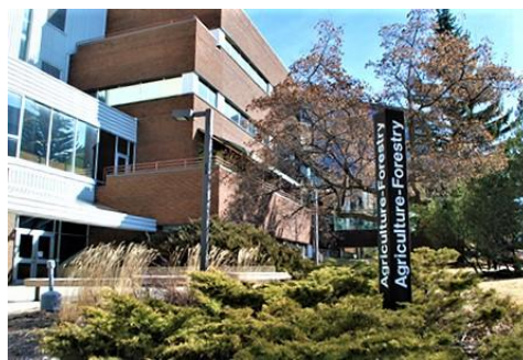
AgForestry building (1981 – 2023 cont.)