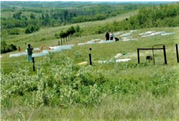
Rangeland field research and instruction

The Faculty of Agriculture, Life and Environmental Sciences (ALES) has a long history of research and teaching in all facets of agricultural production and land conservation systems, including rangeland management.