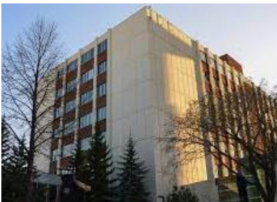
General Services building (1981)

University of Alberta campus homes for Range Team learning (including the 'Batcave' range program herbarium)