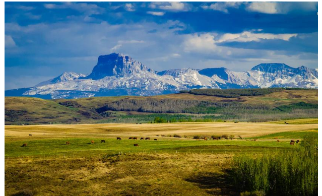
S. Alberta rangelands looking towards Montana