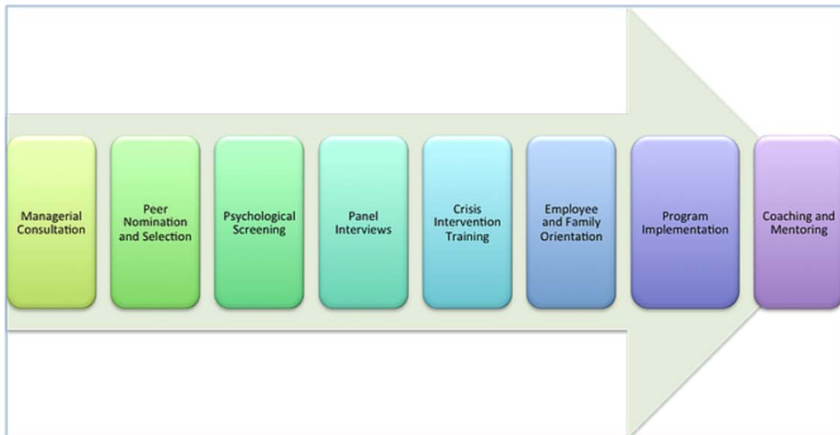
Figure 4.4: First Responder Trauma Prevention and Peer Support Training Program (TEMA)

Some organizations also invite staff members to nominate themselves. The following is an example of a process organizations might use in this case [see the ForYOU Activation policy ].