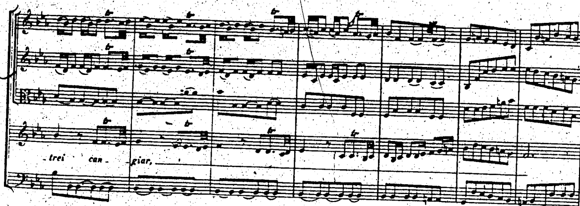
Example 53. Tamerlano , "Benche mi sprezzì," meas. 25-31.