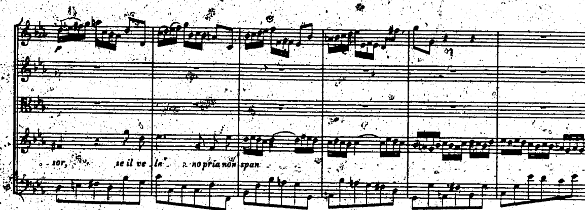
Example 48. Giulio Cesare , "L'angue offeso mai riposa," meas. 36-41.

Rather than detracting from the basic affection, this musical imagery enhances Sesto's fanatical desire for revenge. However, sometimes the simile of the aria text assumes too much importance, or is irrelevant to the dramatic situation and thus obscures the basic affection. In these circumstances, Handel usually seizes upon the imagery of the simile and writes a descriptive programmatic piece of music. These arias are often very charming, especially if the simile is colorful, but without a clearly defined affection, the music tends to be of a more conventional mould. Handel's approach to opera is inherently dramatic, and he required strong affective dramatic situations and aria texts in order to create his most inspired music.