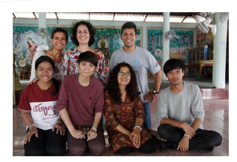
Our International Crew! (Mekong and Amazon)