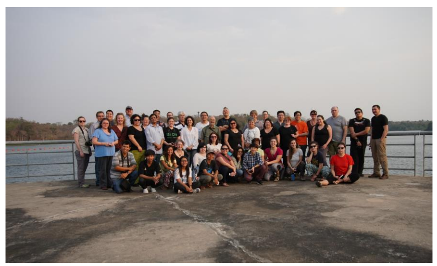
The Group at the Pak Mun Dam!

In February 2017 the Tracking Change project hosted a Global Knowledge Symposium at Ubon Ratchthani University in Ubon Ratchathani, Thailand. The Symposium was an opportunity to bring together those participating in the project from the Mackenzie, Amazon and Mekong River Basins, allowing for discussion on freshwater ecosystems both in Canada and in the international context of Brazil and Thailand.