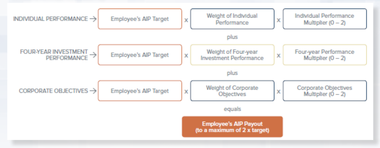
Exhibit A. Annual Incentive Pay

Source: AIMCo Annual Report 2014, Invested in People, p. 64.