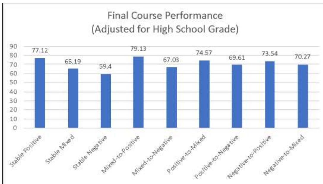
Figure X. A bar chart showing the adjusted final course percentage of each LTA profile.