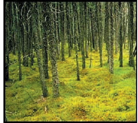
Figure 1. Wooded peatlands from Canada's western boreal region.