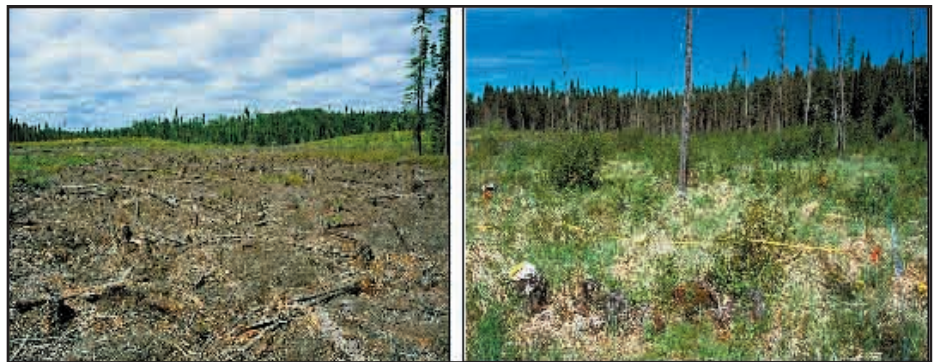
Figure 2. Moderate-rich fens logged in Manitoba. Left, one year since harvest. Right, approximately 10 years since harvest.

microclimate, loss of nutrients with tree biomass, reduction of soil hydraulic conductivity, introduction of weedy species, formation of shrub communities, and loss of productivity due to paludification (peatland expansion). An early (1-12 years post-harvest) stand level study in west-central Manitoba on moderate-rich fens revealed post-harvest impacts similar to those observed in northeastern Ontario peatlands of various types under certain conditions. These impacts are described in further detail below.