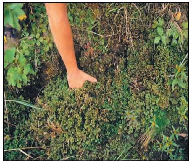
Figure 4. Profuse growth of green tongue liverwort ( Marchantia polymorpha ) within a log skidder tire rut in a logged peatland (approximately 10 years since harvest). Green tongue liverwort is common in peatlands in small localized patches. However, post-harvest monocultures can establish due to high nutrient and water availability, excluding other plants.

Peatlands with organic soils disturbed by logging may be susceptible to the long-term continuity of shrubs. In northeastern Ontario, patches of persistent shrubs may remain on sites for decades and stall succession, and are often referred to as stable shrub communities. The expansion of these dense thickets of alders, willows, and raspberry species on logged peatlands has been associated with the most nutrient-rich sites, such as fens or