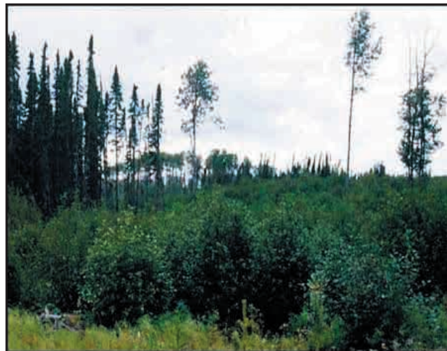
Figure 5. Lush growth of alder, birch, and willows in a wooded moderate-rich fen that was logged approximately 10 years ago. These stable shrub communities can remain for decades once established.

Brumelis, G., and T.J. Carleton. 1989. The vegetation of post-logged black spruce lowlands in central Canada. II. Understory vegetation. J. App. Ecol. 26: 321-339.