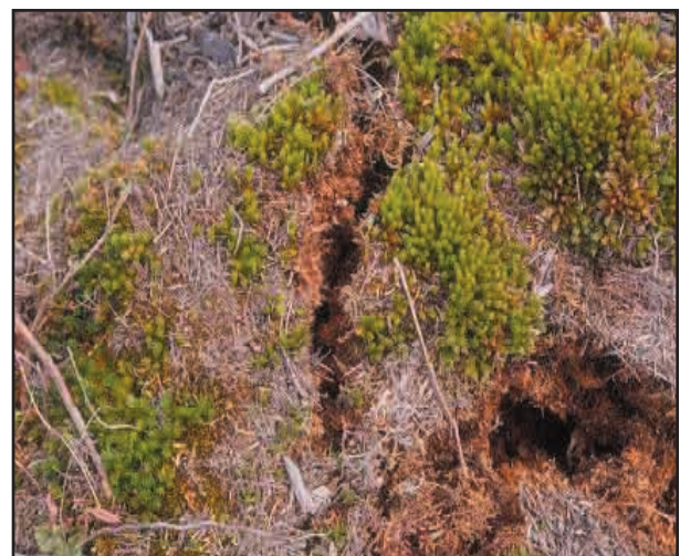
Figure 3. A remaining patch of glow moss ( Aulacomnium palustre ) in a clear-cut wooded moderate-rich fen exhibits desiccation due to exposure to sun and wind and decreased water table.

Preservation of black spruce regeneration after harvest on peatlands is generally not a problem in the eastern boreal region. Current standards including Careful logging around advanced growth (CLAAG) and logging under frozen conditions in the winter have been employed.