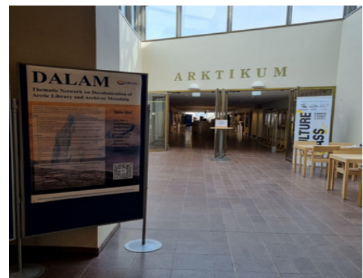
DALAM poster at UArctic Thematic Networks Leads Meeting.