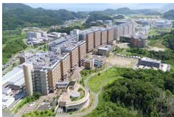
Kyushu University Nagasaki, Japan