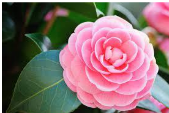
Chuji's favorite flower – the Camellia