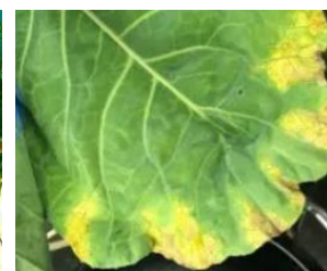
Viral leaf yellows