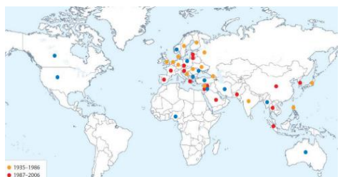
Major crop plant viruses occur worldwide