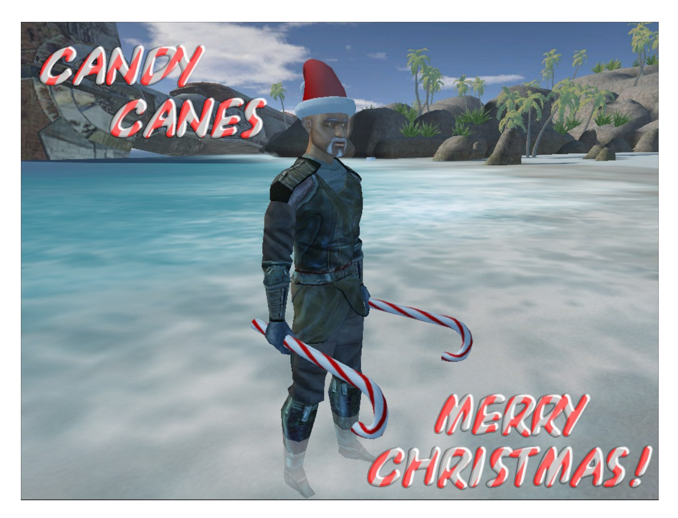
Figure 1. An example of a mod that changes the appearance of items in Knights of the Old Republic (inyriforge 2015a). A character from the game is wearing a Santa hat and wielding two large candy canes.

Other forms of fan creation, such as fan fiction or fan art, can easily be saved in a variety of file formats or can exist as physical items. In contrast, a mod cannot exist physically or even on its own. While one can enjoy many fan creations without being familiar with the source material, mods cannot be played without having access to the original game. Being entirely dependent on the game they are made for adds complications to their already precarious existence. The problem of software obsolescence will be one that we will continually face in the future. However, due to mods' multiple dependencies, they are