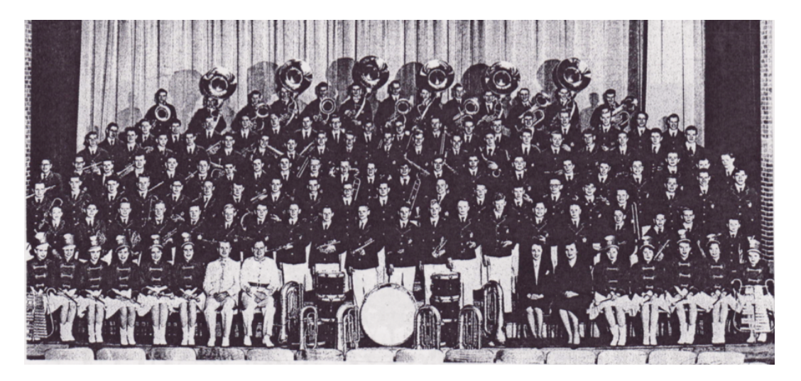
Figure 18. Edmonton Schoolboys Band 1952.

small urge to 'test' him. His music skills and steady manner, even when he had to be stern with us to get to concert condition, provided us with exactly the kind of guidance that developed good musicians and better citizens.<sup>37</sup>