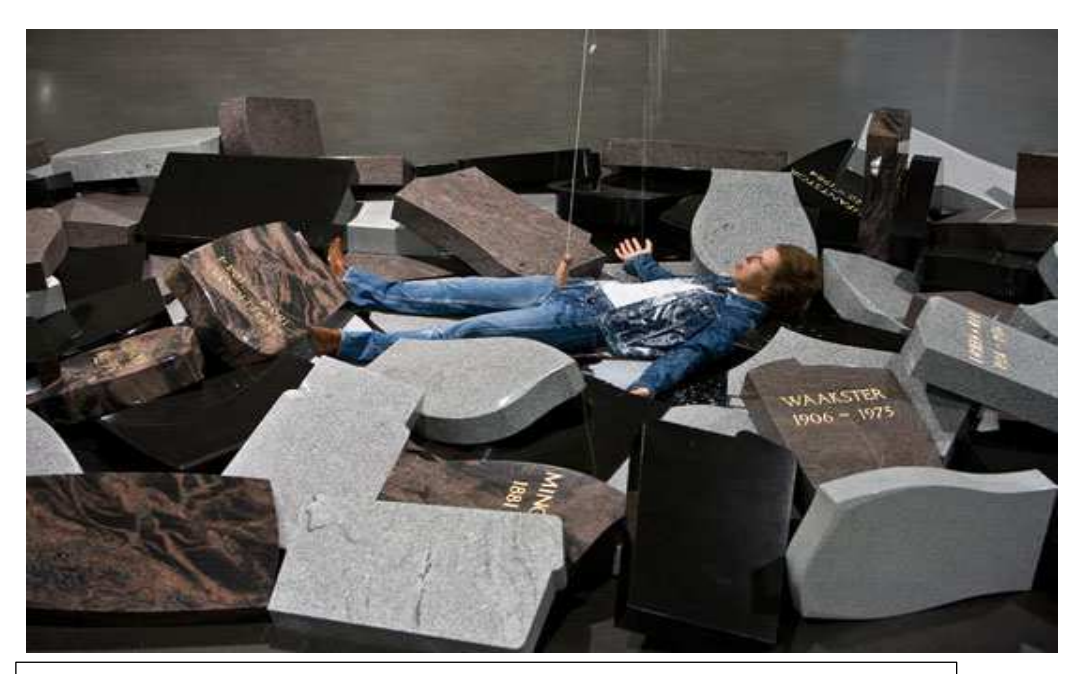
Fig 2: From the Feet to the Brain: "The Sex"