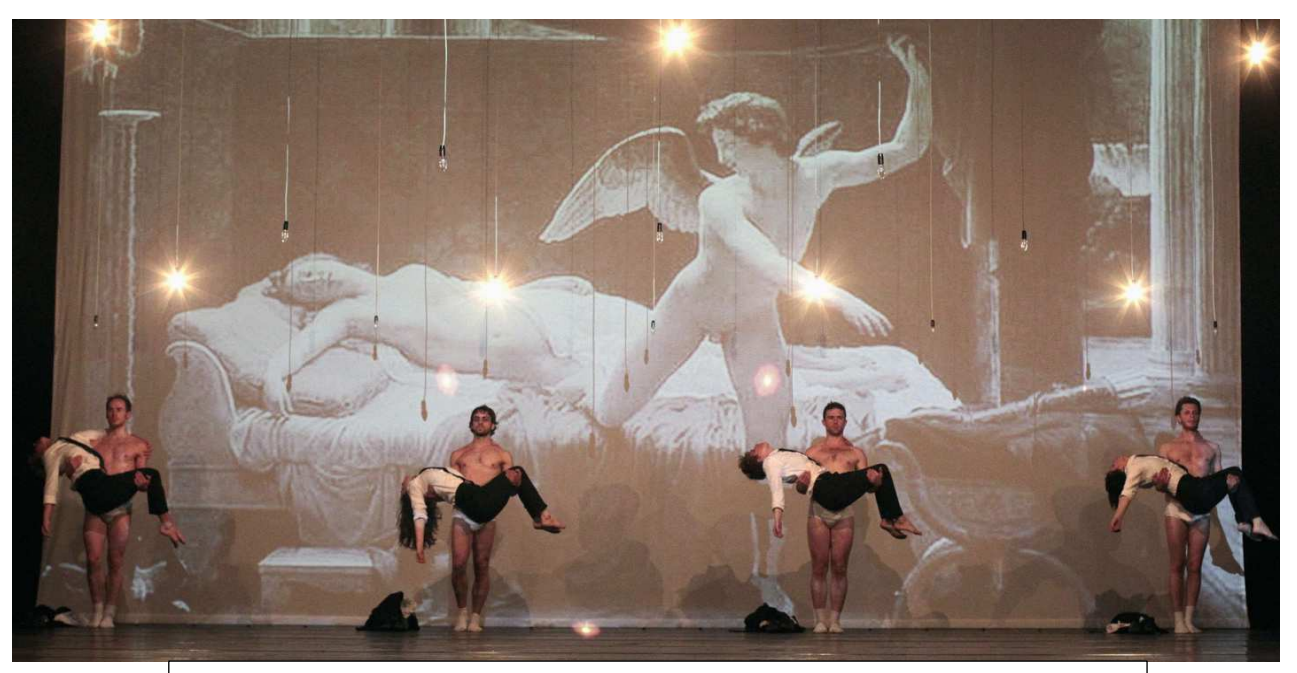
Fig 10: The Power of Theatrical Madness: Knights and Princesses

Physicality dominates the theatrical image in another prominent scene. Near the end of the 2013 performance, or at the beginning of the 1984 performance (depending on which version of the play is being watched), eight performers, four men and four women, are lined up at the back of the stage (see fig 10).