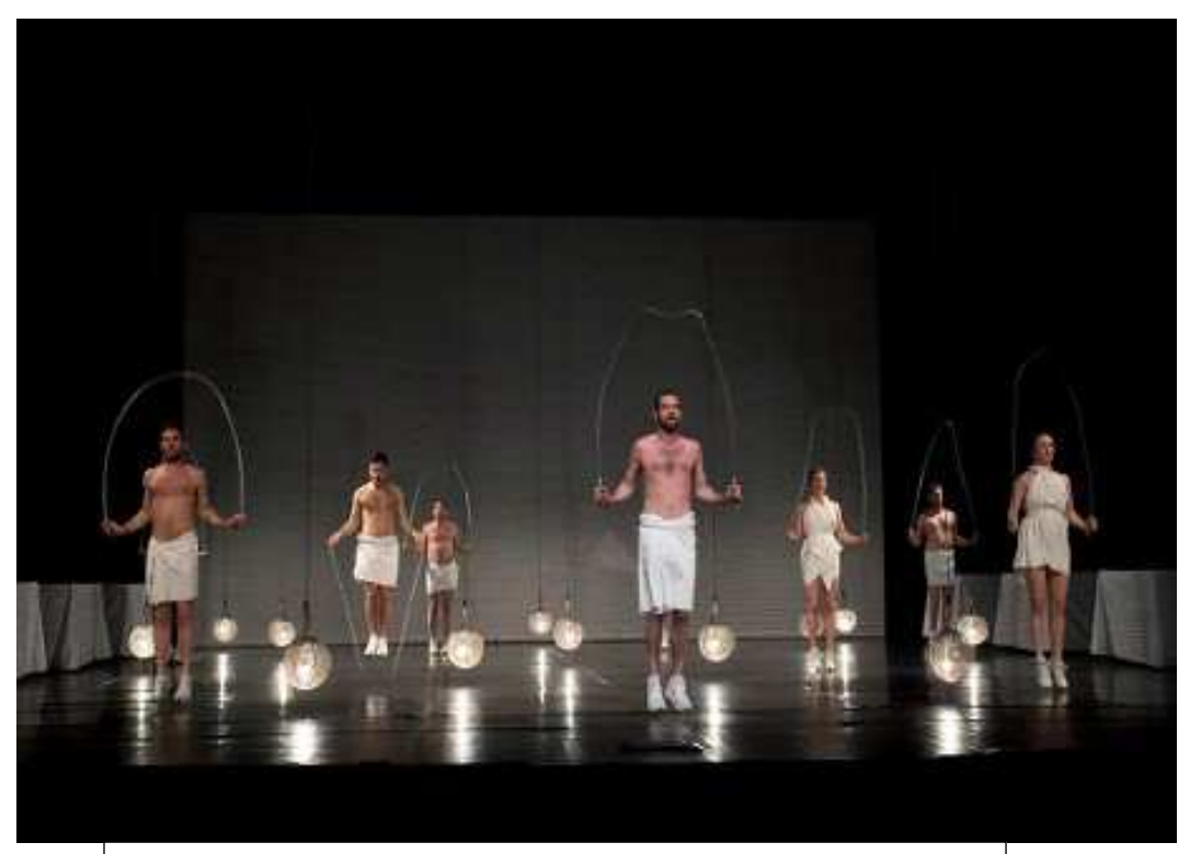
Fig 7: Mount Olympus: Chain Skipping Scene

The actors skip chains for over 30 minutes, reciting the same chant until they are completely drained, short of breath, their sweat secretion glittering under the spotlights. They relax on stage for a few minutes and have a snack and keep repeating the exercise for another few minutes. Wilkins expresses his reaction towards this scene: