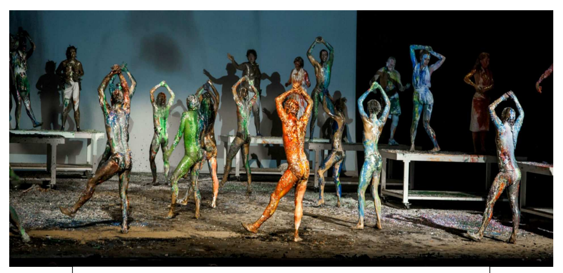
Fig 6: Mount Olympus: Ending Scene

Fabre has always been interested in seeing how far the body can go and testing its limits, and a central strategy in his approach is the use of endurance and exhaustion. Early on in the performance, a drill sergeant leads a military style chain -skipping sequence (see fig 7) in a question-and-answer workout chant. Critic Ayelet Dekel, founder of the Israeli online magazine Midnight East , refers to this scene as one of the "stirring instances of endurance, evoking a strong response from the audience, who clapped, as if to encourage the performers to go on despite their fatigue." The sentences they keep chanting endlessly include: