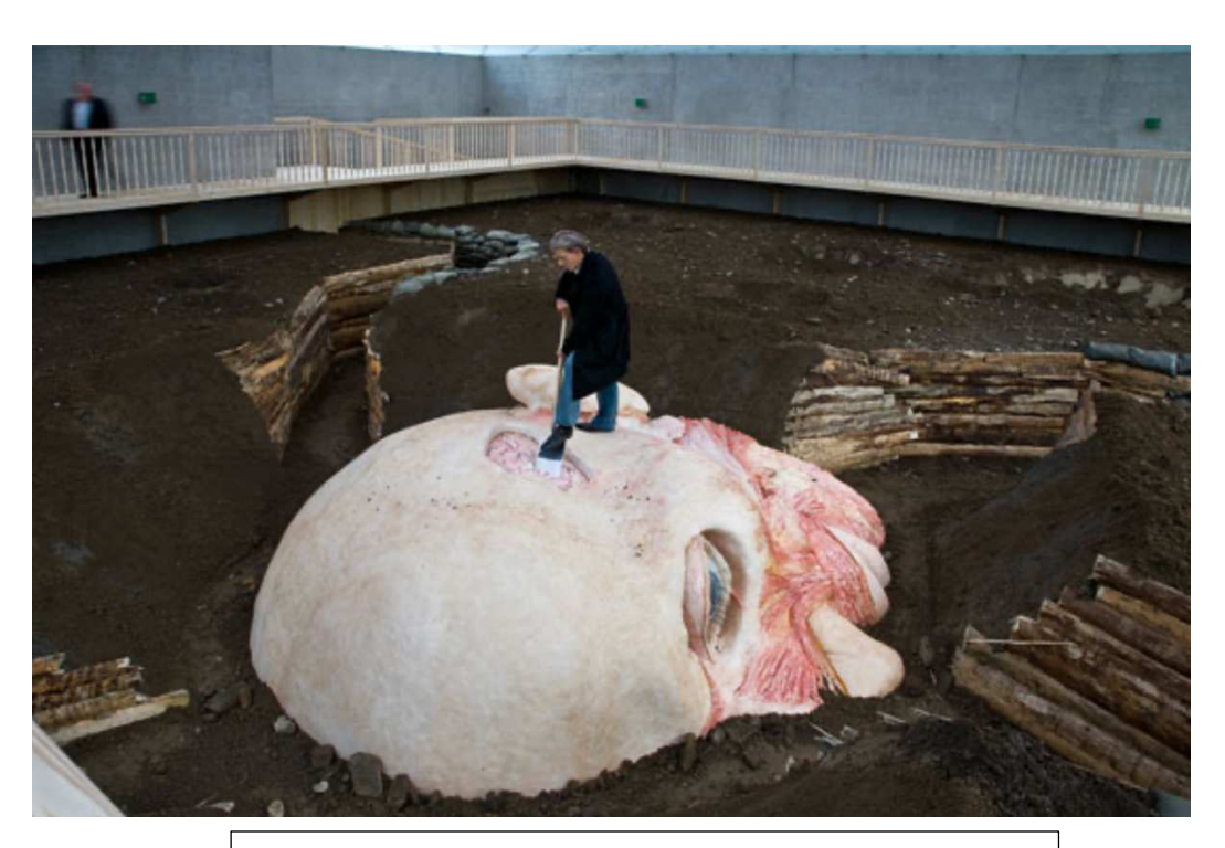
Fig 5: From the Feet to the Brain: "The Brain" (Markus Tretter)