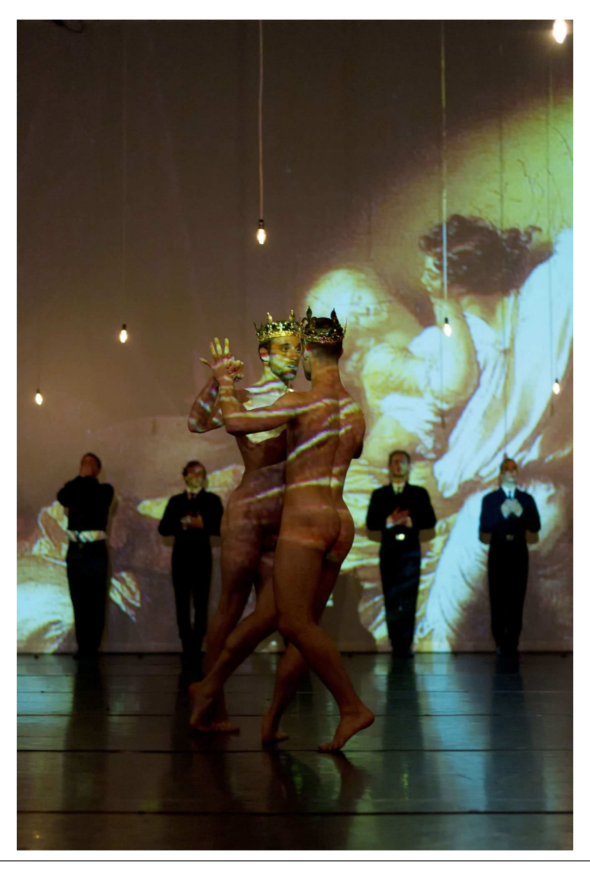
Fig 13: The Power of Theatrical Madness: The Emperors' Dance

stage but is constantly being pushed away by the man. Another scene that comes to mind is the two emperors dancing together; this is one of the most beautiful, powerful and important scenes.