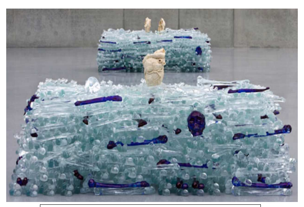
Fig 4: From the Feet to the Brain: "The Heart" (Markus Tretter)