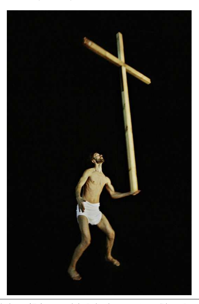
Fig 16: Orgy of Tolerance: Christ Balancing Cross Scene

That image is, I think, a very poetical metaphor for the production... It's not a ridicule, it's not trivial [...] This Christ is trying to balance his own cross. In the same way, mankind is on the edge, trying to survive, needing to find a social balance. There is an incredible hunger for material things, for status—for those fake orgasms; from sex or yes, from expensive shoes (Brennan).