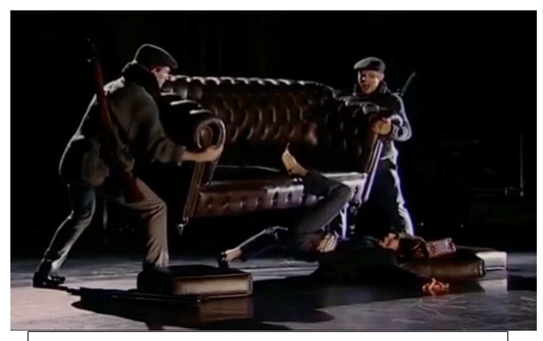
Fig 14: Orgy of Tolerance: Couch Scene

is joined by two men who keep sliding down a leather sofa on her continuously until they collectively reach a groaning climax (see fig 14).