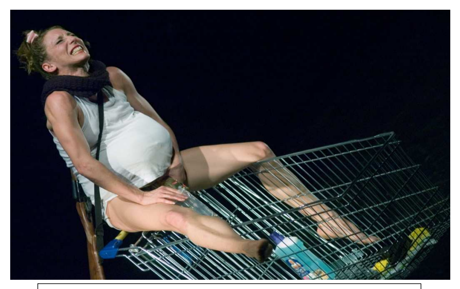
Fig 15: Orgy of Tolerance: Shopping Cart Scene

extremely important to the point where people are willing to go through a process as painful as giving birth, just to satisfy their desires and acquire the products they are longing for.