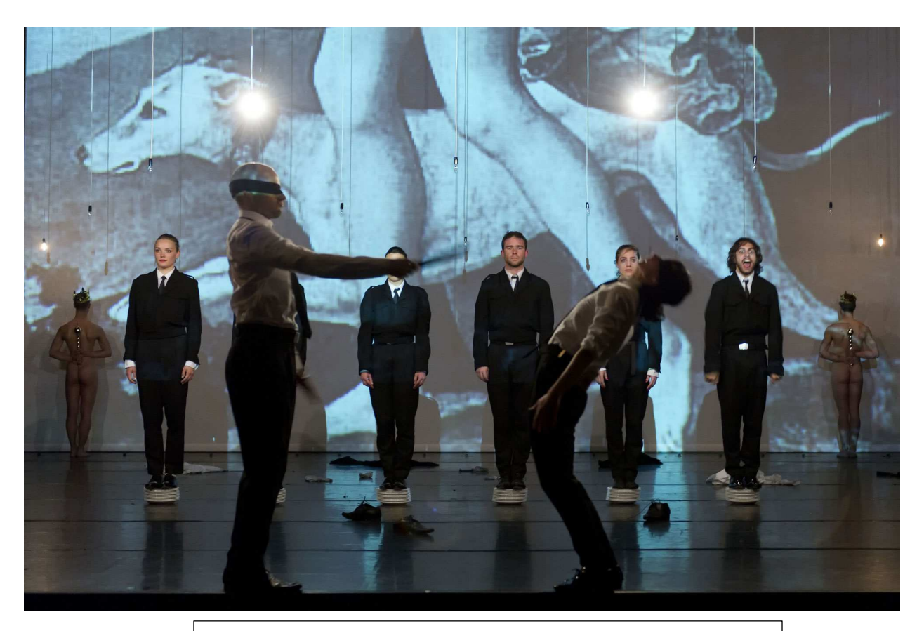
Fig 8: The Power of Theatrical Madness: Knife Scene

After having conversations with spectators who witnessed this scene live, I was informed that the two performers knew when to stop marching towards each other as soon as they stepped on a tiny bump on the floor that is hardly seen. Fabre's aim is to abolish reality and maintain the essence of theatricality, which Van den Dries describes as "the beautiful lie of theater" and he elaborates using and contradicting Brecht's famous cloakroom commentary: