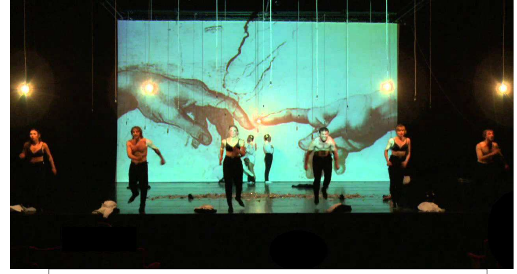
Fig 9: The Power of Theatrical Madness: Physical Exercise

name of the production (Lehmann 100). They guess where that production was performed. After frontally jumping/jogging for about 20 minutes nonstop, repeating the same names,