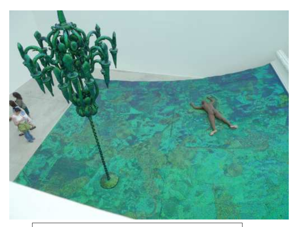
Fig 3: From the Feet to the Brain: "The Belly"