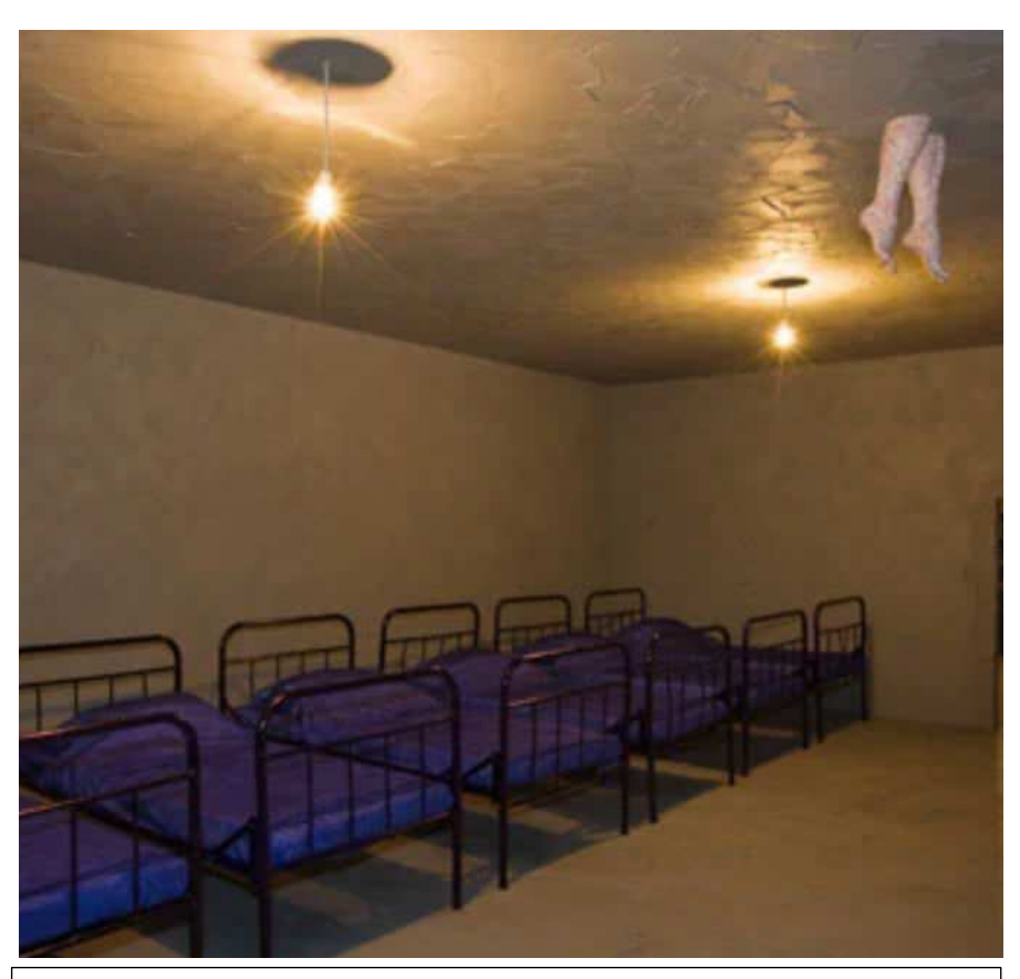
Fig 1: From the Feet to the Brain: "The Feet"

project, Fabre creates five sculptural tableaus with the purpose of exploring a universe of beauty, horror, and metamorphosis that is somewhat confusing, appealing, and difficult to conceive in conventional artistic terms. It is a universe where dreams and reality are continuously alternated. ("From the Feet to the Brain") The project was initially shown in Kunsthaus Bregenz, an art museum in Bregenz, Austria, and curated by Eckhard Schneider. Venice provided the ideal context for the project; its water, liquidity, and glass, all relate to Fabre's work, as explained by Giacinto Di Pietrantonio, Italian curator of the museum Galleria d'Arte Moderna e Contemporanea di Bergamo. What follows is an analysis of Fabre's project with reliance on the documentary From the Feet to the Brain which was filmed by the production company La Compagnie des Indes.