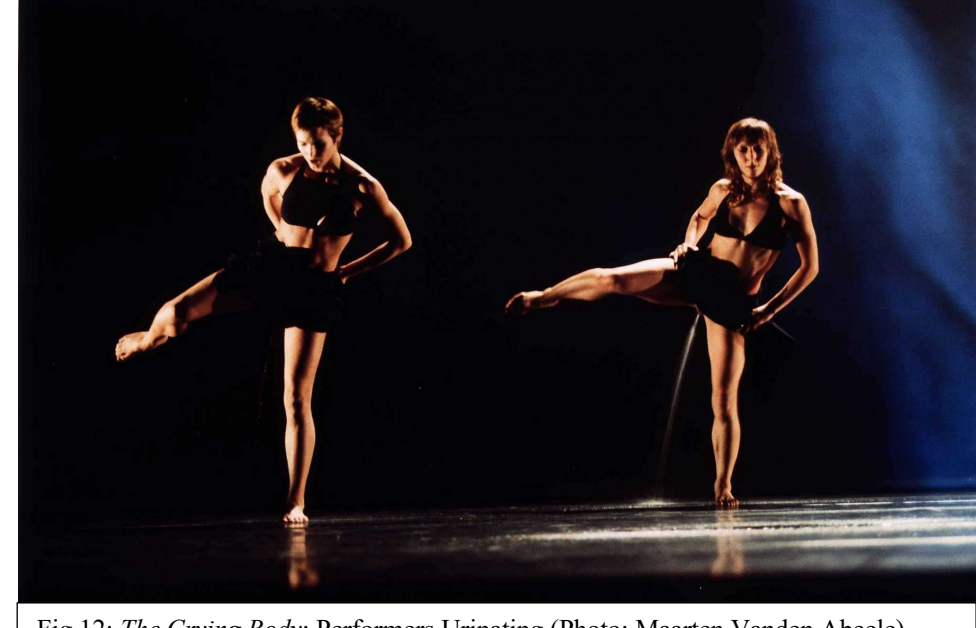
Fig 12: The Crying Body : Performers Urinating

and is a favorite tool for creating Fabrian corporeal imagery on stage. In one of his productions called The Crying Body (2004), Fabre introduces the weeping body on stage. In this scene, three