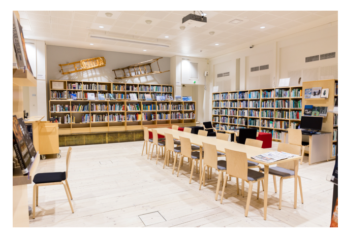
Arctic Centre Library.

The snow melts, plants grow in the heat of the sun, and the birds sing. What could be nicer than searching for information about all these subjects that belong to the Arctic ecosystems, e.g., Lapin tiira (Lapland's tern), tunturiunikko (Arctic Poppy), sinirikko (Purple Saxifrage), vaivaiskoivu (Draw Birch), lumihyppiäinen (Entomobrya nivalis) or about great explorers: Nordenskiöld, Nansen, Castrén...? These remain in your memory for a few weeks; then the details are forgotten. In the Arctic Centre Library you can find things, that—following the words of the Finnish song—never cease to amaze and puzzle a small wanderer."