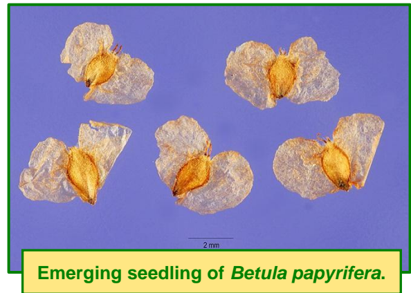
Emerging seedling of Betula papyrifera .

Longevity: Seed can remain viable up to 3 years (Smreciu et al. 2002). Safford et al. (1990) suggest that storage up to 8 years is possible when stored in sealed containers at 2 to 4°C at low moisture.