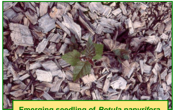
Emerging seedling of Betula papyrifera .

Greenhouse Timeline: 16 weeks in the greenhouse before out-planting. Plants can be over wintered for a spring or early fall plant (Wood pers. comm.). Grow for 120 days prior to harvest (Formaniuk 2013).