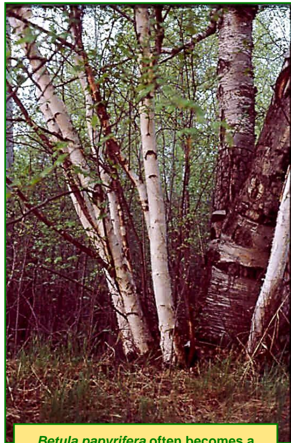
Betula papyrifera often becomes a multi-stemmed tree.

Seral Stage: Can form pioneer stands on disturbed sites in boreal systems. (Hardy BBT 1989).