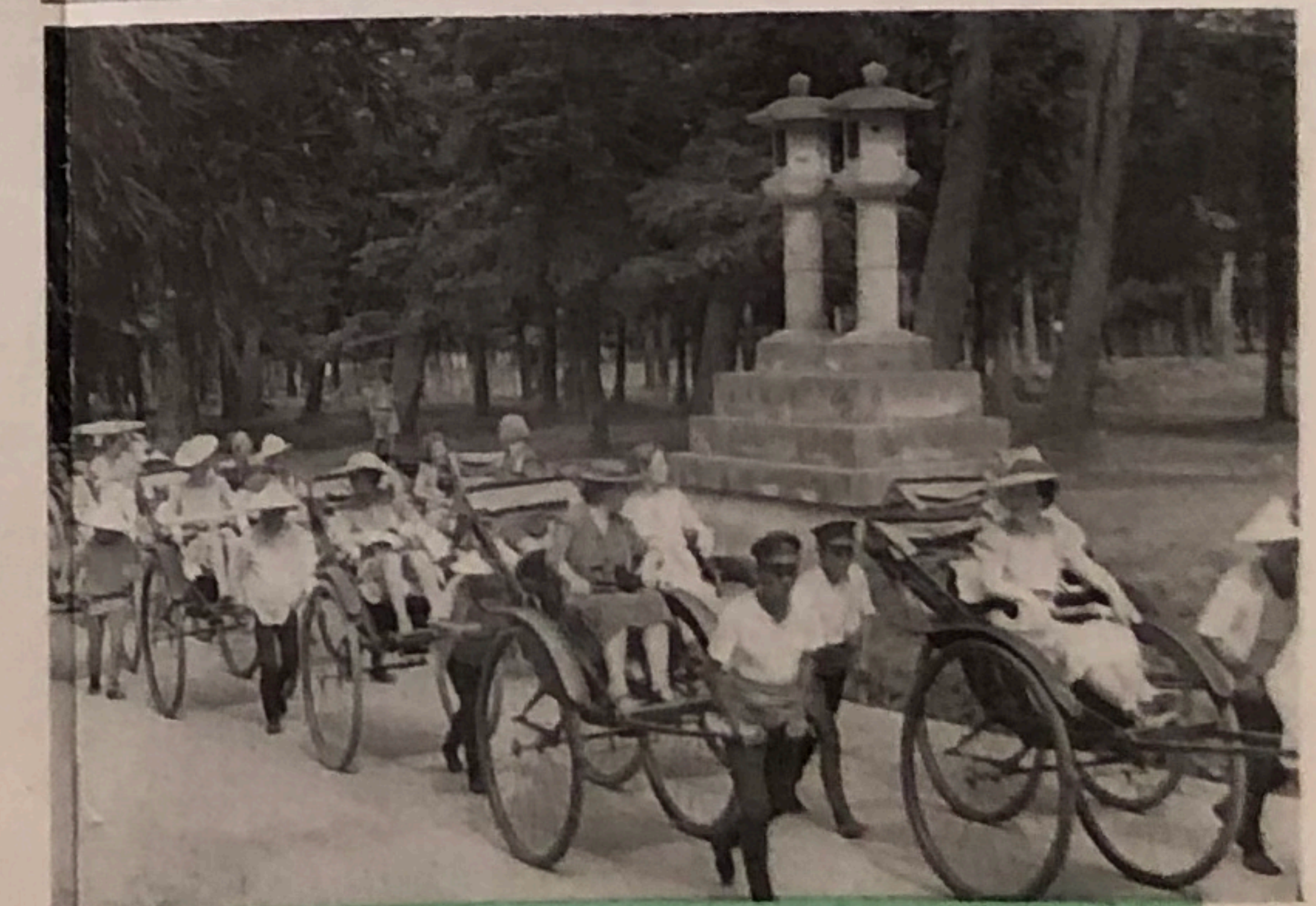
Top: The Minister of Railways greets the teacher guests. Center: When the party visited the Nagoya Castle. Lower: Sightseeing by ricksha in Nara.