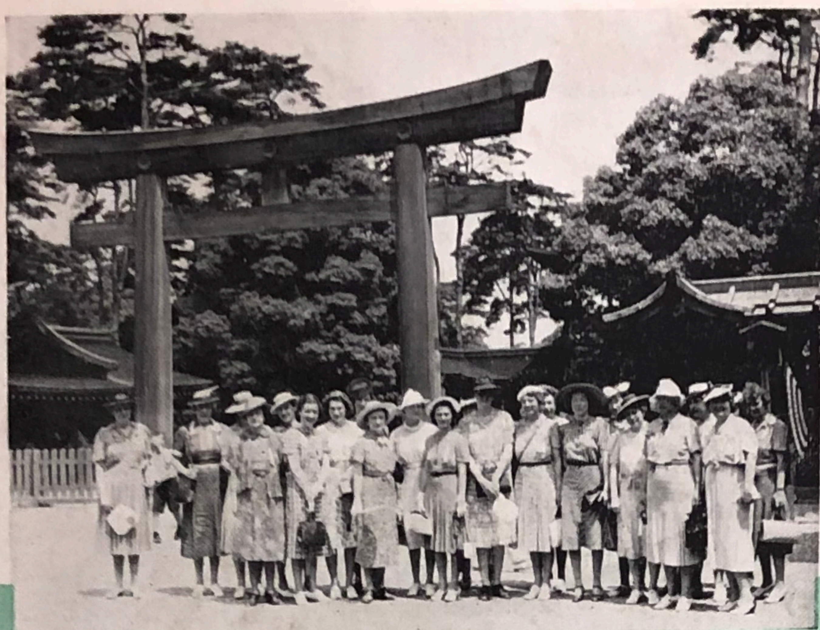
Teacher guests at the Meiji Shrine, Tokyo.