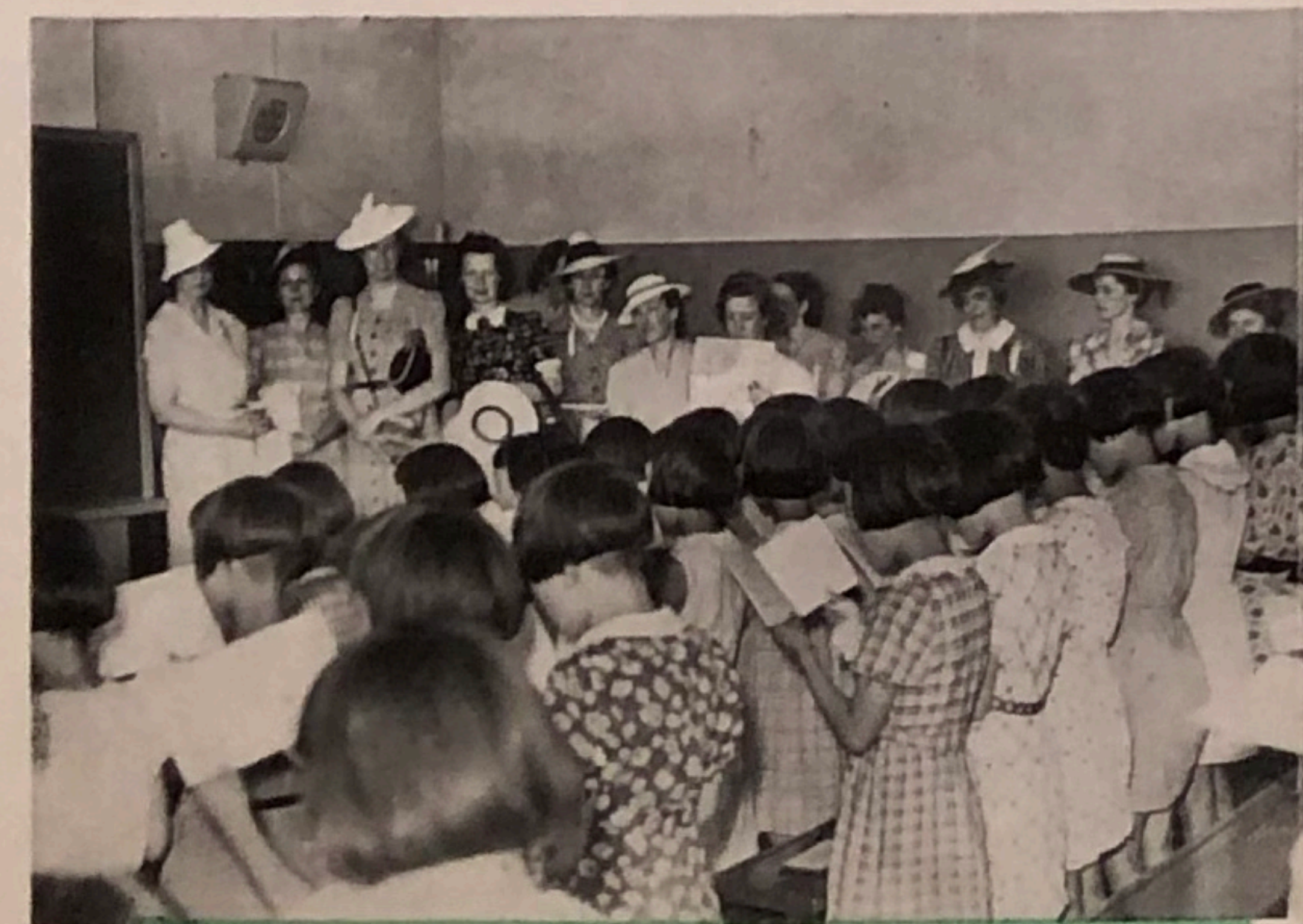
Top: Teachers pose before the Shrine Gate at Nikko. Center: A Suki-yaki dinner at Karuizawa. Lower: A visit to one of Tokyo's primary schools

THIS leaflet is dedicated to the members of the American and Canadian High School Teachers' Tour Party which visited Japan in the Summer of 1939 at the invitation of the Board of Tourist Industry of the Japanese Government Railways, Tōkyō. It is hoped that this pictorial record will serve in some small