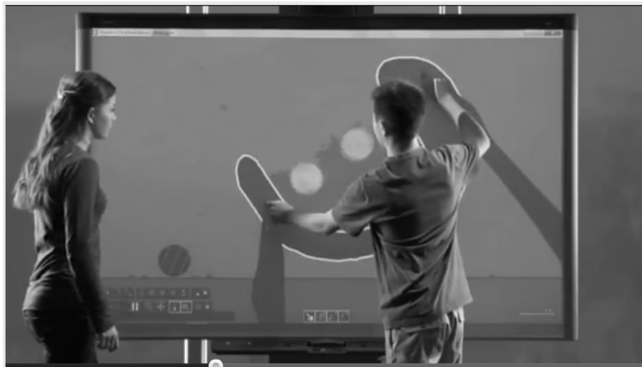
Figure 2-2. Rotating Gesture. Screen capture from: Smart Classrooms (2012). Note the two-hands zoom in and rotating gesture.

How do school actors interact with IWBs? An image is projected into a touchscreen and the user is invited to make certain gestures in order to interact with the content projected onto the screen. Some gestures include: Swiping to delete, highlight or underline; tapping on the screen to select an object, close a window or activate a function; tracing with the finger to delineate, draw, colour, or write; flick to move an object; apply left and right index fingers to the screen at the same time to zoom in, zoom out, and rotate an object.