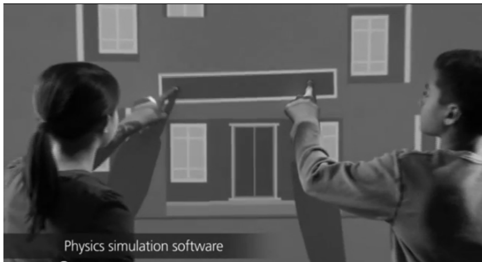
Figure 3-1. Moving the parts of an image. Screen Capture from Smart Classrooms (2012a). The children in the video are moving parts of an image

certain types of interaction, such as some gestures to move, drag or drop an image displayed on the screen. These movements are meaningful; they are directed towards the device and produce certain effects reflected on the screen. The meaningfulness of the gestures depends upon the IWB's affordances: A malfunctioning device would not afford the same actions that a functioning device would. Furthermore, the IWB's affordances direct certain types of perceptual stimulation that guide action. For example, Smart Classrooms (2012a) reported on one physics application that invite the users to drag, drop and move objects on the screen in order to simulate the application of certain principles of physics.