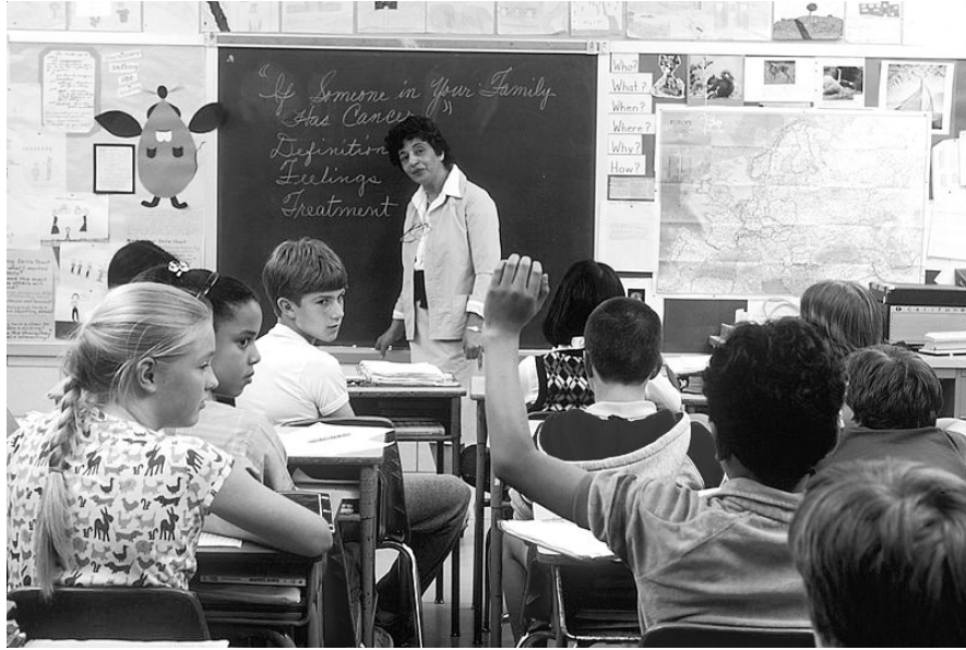
Figure 2-3 Classroom. http://commons.wikimedia.org/wiki/File:Children_in_a_classroom.jpg#file . Image released into the public domain by the U.S. National Institute of Health

Can you guess how many policies were being enacted in that particular moment when the picture was taken? According to Ball, Maguire and Braun (2012) a school can enact hundreds of policies simultaneously. From a pedagogical perspective this picture shows a group of students and a teacher in a lesson, but from a policy analysis perspective, this picture can show that many policies are taking place. Students are sorted by similar age, at the same time, in the same room, they are taught by one teacher, they are sitting in desks, organized in rows, reading from a book on a particular subject, at a particular time of the year, at a particular time of the day. The list could go on, but this brief inventory reveals the many practices that are instantiated as policies are enacted in the school.