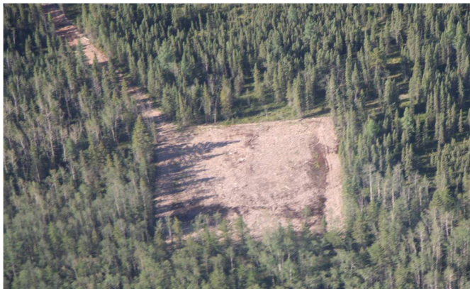
Figure 10: An example of a well site that has excessive amounts of wood mulch on the site, hindering regeneration.

As a result, mulching should only be used for specific applications. For example, wood chips may be beneficial on dry sandy sites to preserve moisture on the site. This is currently being investigated through research at the University of Alberta. Some companies have also explored the use of wood mulch for constructing wood fibre roads and mulching is also a common tool for clearing seismic lines. This guide is not meant to address these specific applications.