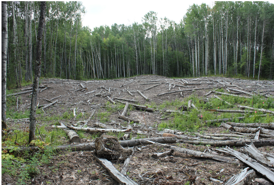
Figure 7: An example of an effective application of woody materials. Logs were kept intact, no excess volumes were left on site and variable log lengths were applied.