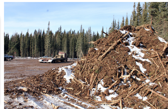
Figure 6: Examples of short-term woody material storage piles at the corner of oil sands exploration sites.