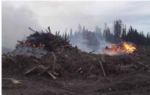
Piling and burning

In a short period of time, the conversation around handling woody materials - deadwood such as logs, branches and stumps - has shifted dramatically. From piling and burning, to mulching and now towards keeping 'whole logs' on sites. The changes have led to confusion and this guide is intended to provide clarity around wise use of woody materials in reclamation programs.