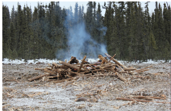
Figure 5: Valuable forest floor material and woody materials being burned following site clearing.