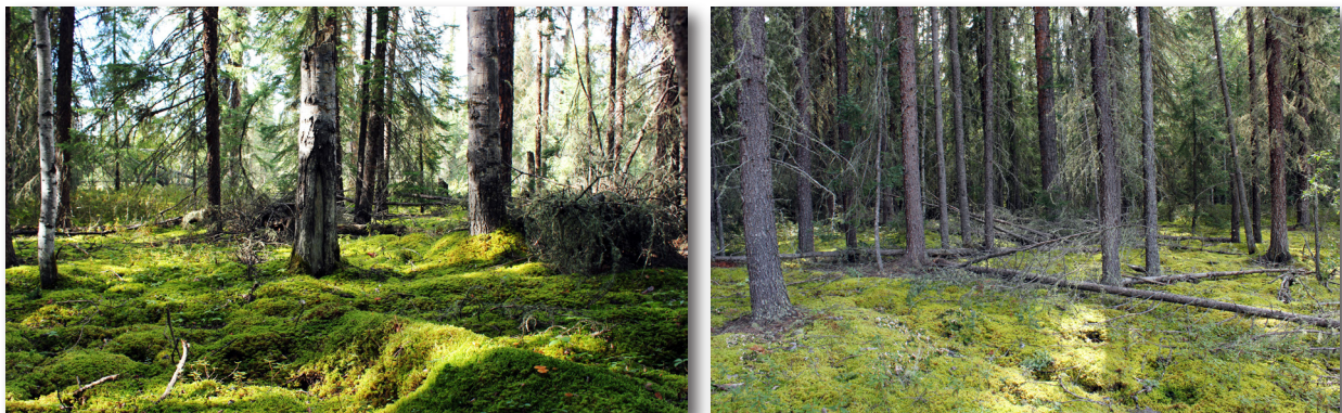
Figure 4: Examples of woody materials found naturally within forests.

Woody materials are also found in forests and help to create diversity. This diversity leads to the creation of microsites in the forest floor and is also a key contributor to habitat for biodiversity in forests. By applying woody materials to reclaimed sites, we are able to capitalize on processes that occur all the time in forests - and in turn, promote regeneration on sites.