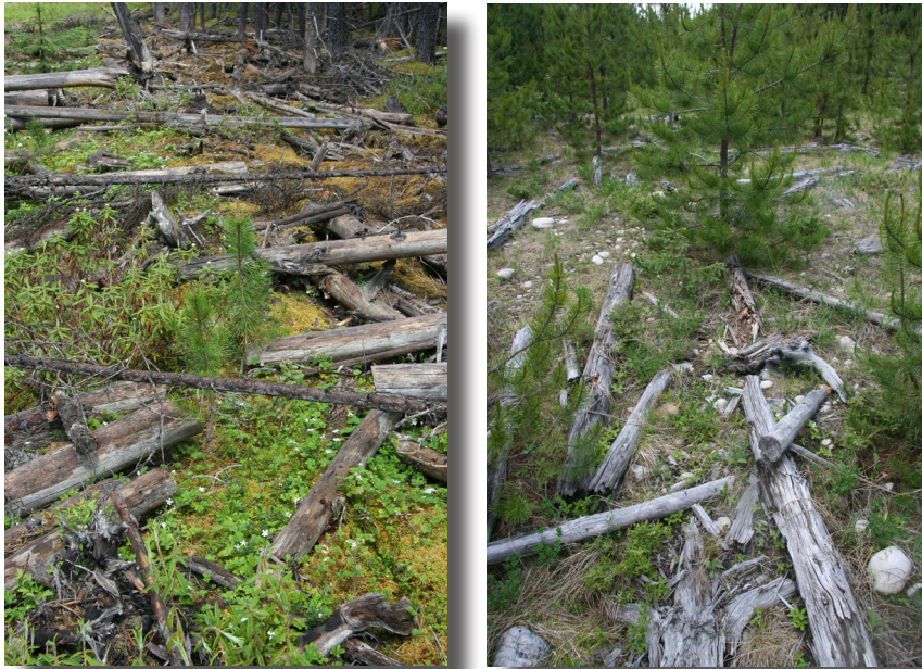
Figure 8: A seismic line (left) and pipeline (right) benefiting from the application of woody materials.

Managing access and restoring wildlife habitat along linear features is increasingly a concern of industry and woody materials have been promoted as a means to assist both objectives. Similar to industrial sites, application of woody materials on existing features - such as seismic lines, pipelines and roads - has the potential to introduce critical microsites and promote vegetation re-establishment.