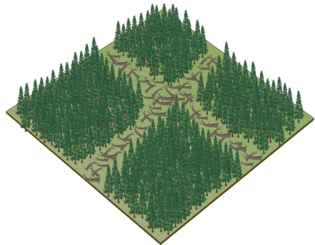
Figure 9: Rollback appears necessary to deter human use of access features. Fuel breaks are required every 250 metres. (Image was created using tools from the Integration and Application Network ian.umces.edu/symbols/ ).