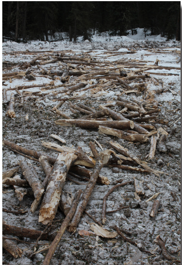
Figure 11: Examples of logs that have been rough mulched to keep most of the log intact.