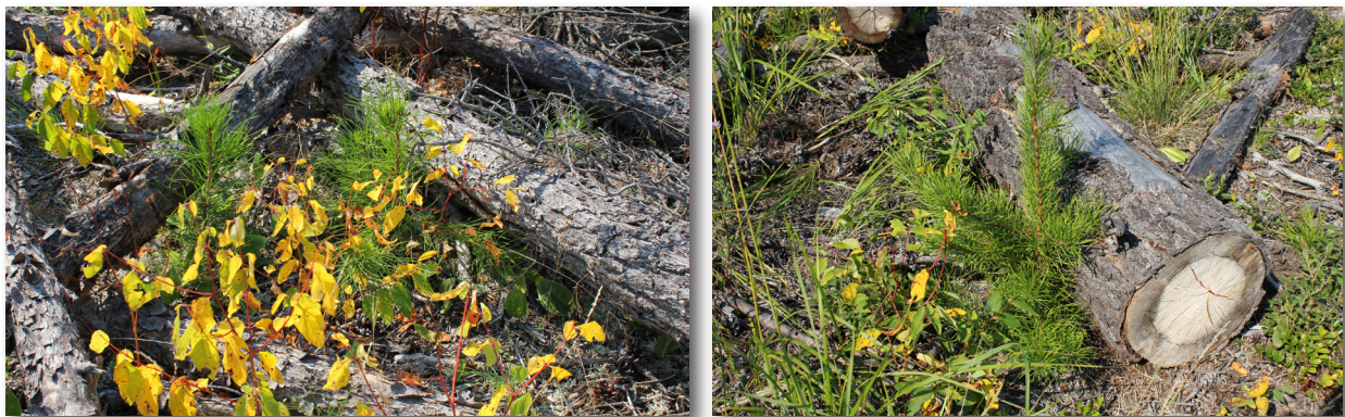
Figure 3: Following application of woody materials, it is common for plants to establish right beside logs because of the creation of microsites.

Microsites provide diverse habitats in which trees and other plants can establish.