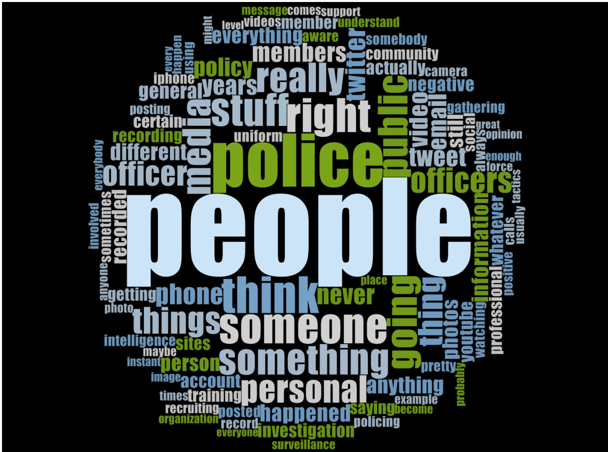
Figure 4: Representation of the most commonly used words from the six participants in response to the interview questions.

The second word cloud represents the words most often used by the EPS Twitter account in its communications to the general public. This caption was taken on April 6, 2014. The most commonly used expression was “@joineps.” This reference is consistent with the six respondents reporting that the EPS uses social media for EPS recruitment purposes.